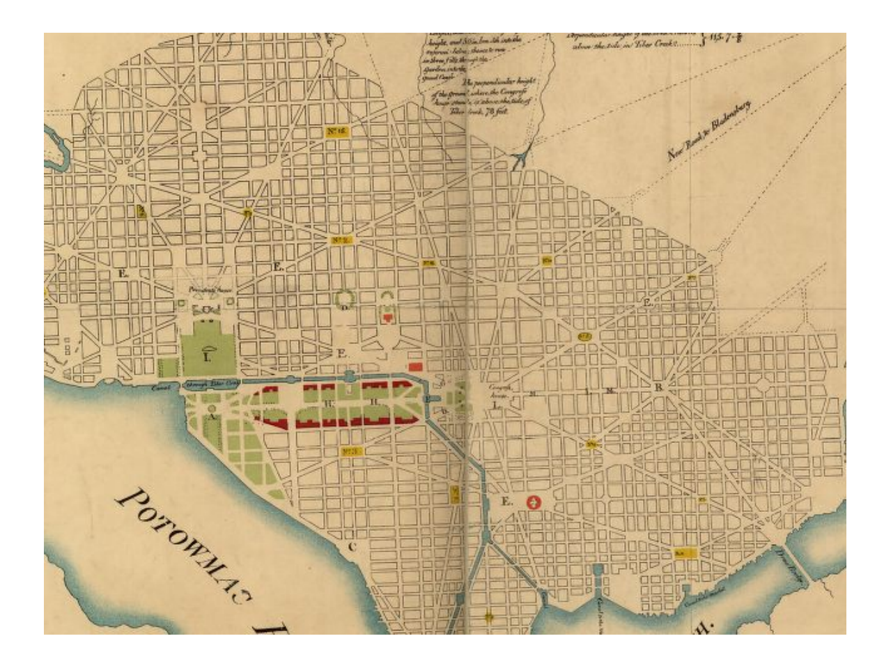
Figure 1. L'Enfant's plan for the City of Washington. Note that despite the fact that L'Enfant did not insert buildings (apart from the Capitol and President's House) into the grid of streets, the landscape looks filled. See figure 2 for contrast. (Pierre Charles L'Enfant, Plan of the city intended for the permanent seat of the government of t[he] United States : projected agreeable to the direction of the President of the United States, in pursuance of an act of Congress passed the sixteenth day of July, MDCCXC, "establishing the permanent seat on the bank of the Potowmac" Map. Washington, D.C.: United States Coast and Geodetic Survey, 1887. From Library of Congress, American Memory Collections).