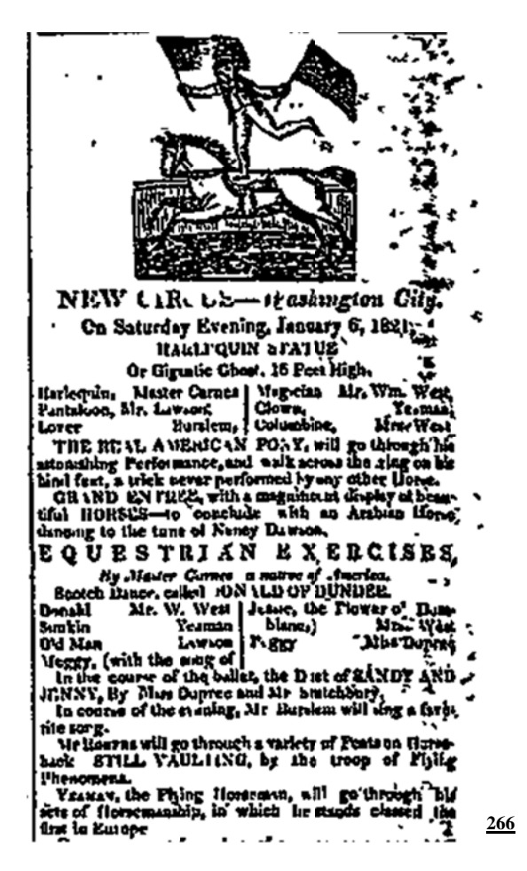
The addition of a permanent circus building in the District expanded

Washington's entertainment options significantly; throughout the 1820s, several troupes and managers showcased their talents before capital audiences. Unlike Carusi's Washington Assembly Rooms, the circuses that came to Washington provided a source of intense competition for the theatre. Performance seasons at the circus were long and frequently overlapped with those of the theatre. As I noted in the last chapter, the circus offered similar entertainments to the playhouse. Distinctions between the circus and the playhouse would become even more blurred throughout the 1820s, as melodramas and