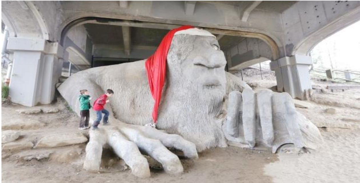
Photo 4: Community members interacting with the Seattle's Fremont Troll