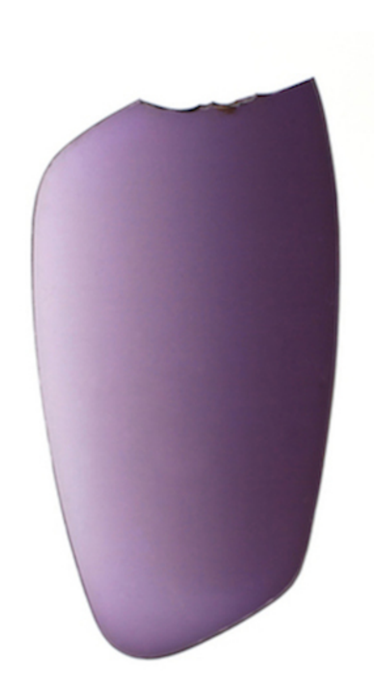
Fig. 6 - Ex umbra in solem: "from the shadow into the light"