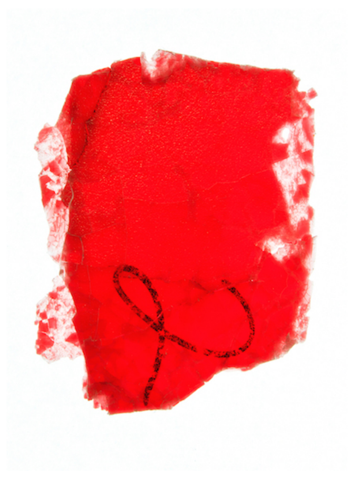
Fig. 4 - "Circumlino"

(seer-coom-lean-yo) smear all over, besmear, anoint, dab, bedaub, cover