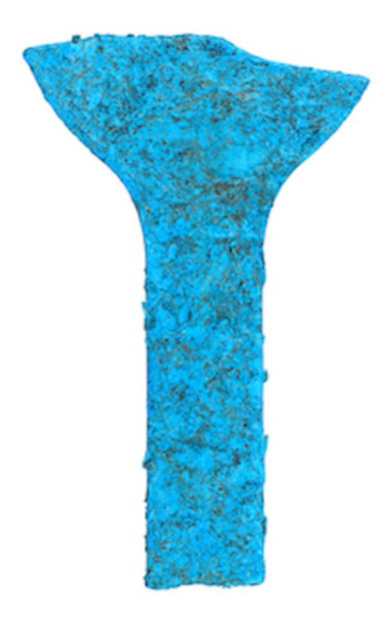
Fig. 5 -Nanos gigantium humeris insidentes: "standing on the shoulders of giants