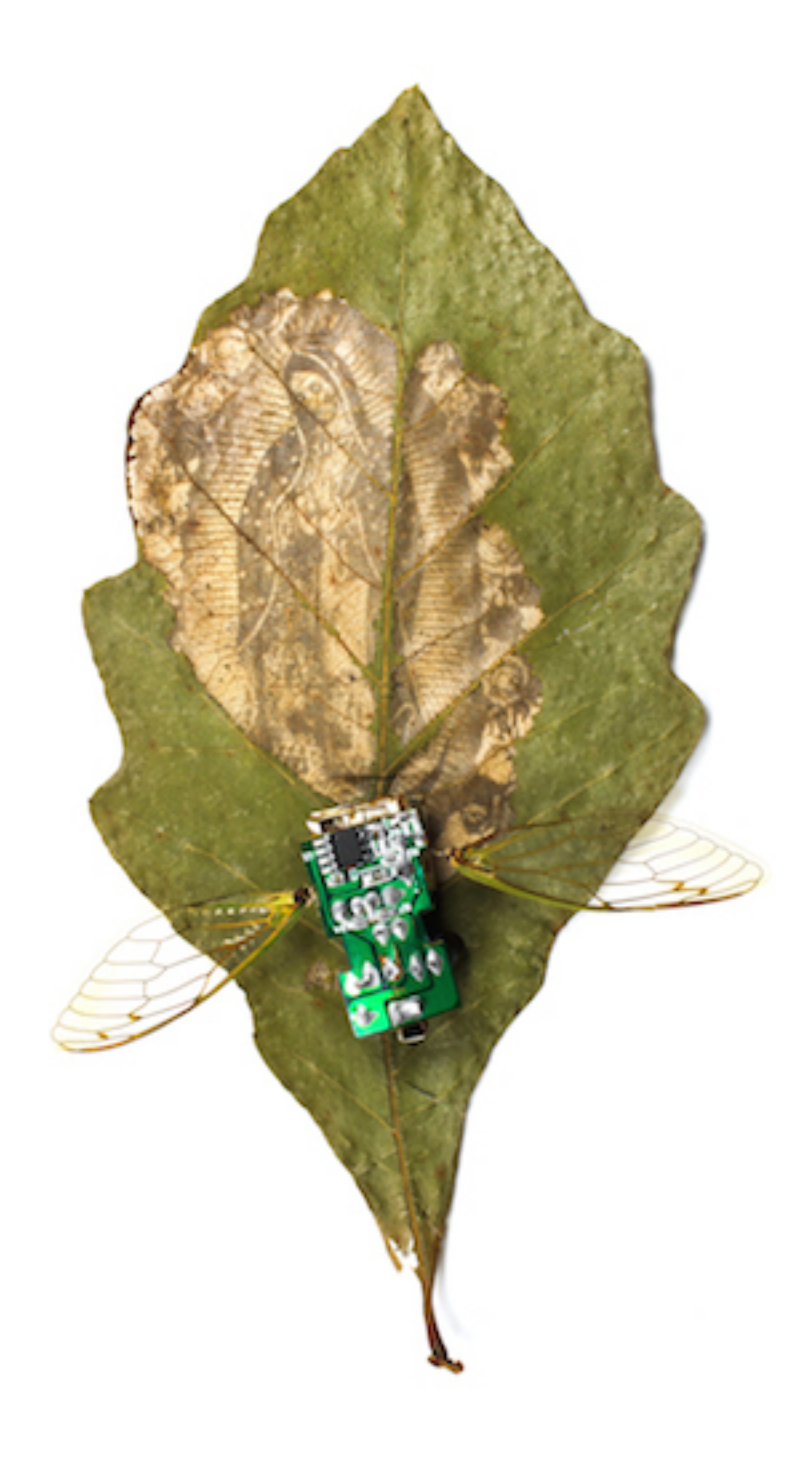
Fig. 1- In rerum natura: "In the nature of things"