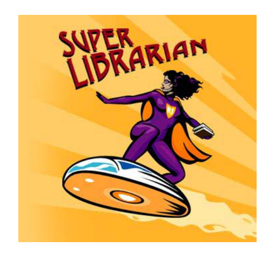
Figure 2. The New Jersey State Library's Super Librarian

If these representations made me cringe, how did other librarians feel? Why couldn't these representations drop the more familiar trappings of librarian stereotypes? Furthermore, did they have to be women, and did they even have to be white? Are sexy and shapely representations (like Super Librarian) the way to go? Or will that somehow reinforce or create a new stereotype? Was everyone reacting like me, or was I overreacting? And did it matter? What about these representations of librarians that come out of the library profession itself? Do librarians ambiguously represent themselves? Focus group discussions would help me see more clearly that these representations could indeed hold multiple meanings, as well as have a political edge.