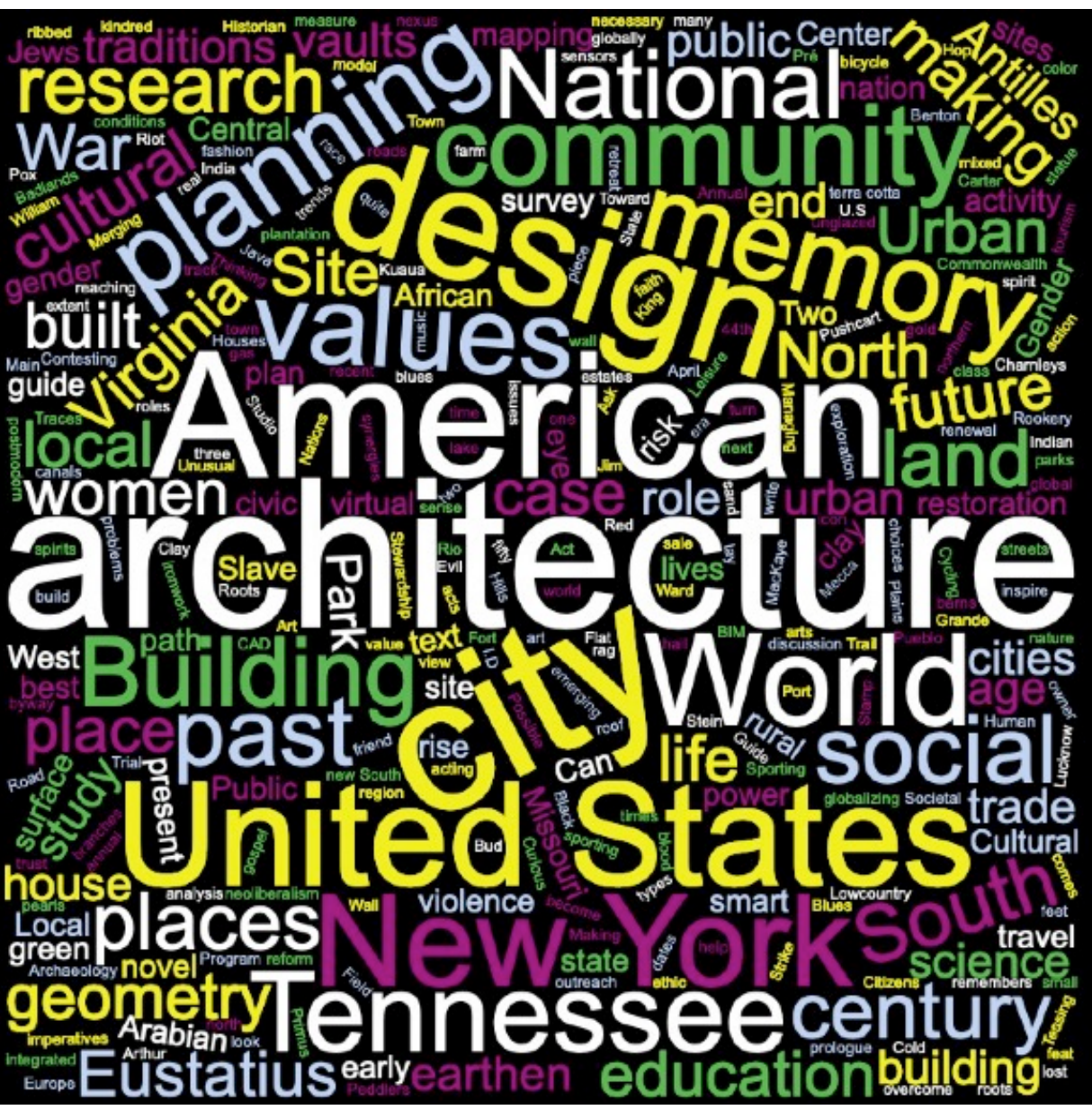
Figure 1. Word cloud of publication titles.

In total, the process described in the method section resulted in the collection of 530 publications that define the corpus of "intradisciplinary preservation scholarship." In order to visually characterize this corpus, I created a word cloud from the publication titles (figure 1). I purposefully omitted the expected words and phrases associated with "history," "historic," "heritage," "conservation," and "preservation" as they overwhelmed the cloud.