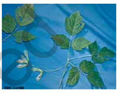
Boxelder Tree Leaves and Seed Pods

Eggs hatch into nymphs in late spring and early summer. They feed during the summer primarily on leaves, twigs, and seeds of boxelder trees. Boxelder trees have separate male and female trees. Female trees bear winged seeds (pods) and male trees do not. The largest bug populations tend to build up on female trees. These