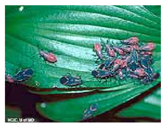
Boxelder bugs clustered on leaf