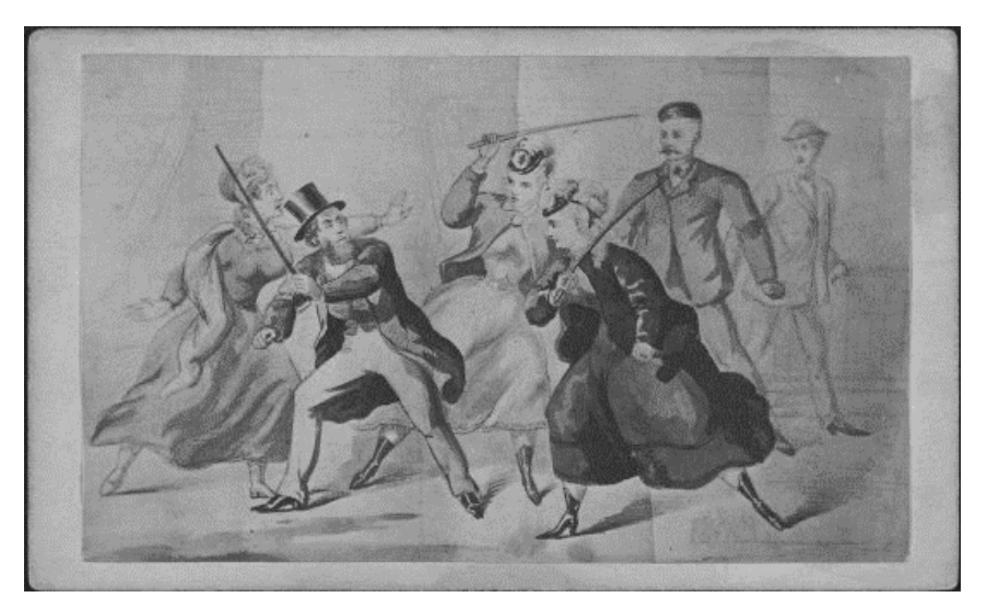
Lydia Thompson and her compatriots whipping a Chicago Tribune editor, Houghton Library, Harvard University.

]variety woman acting out of order.<sup>11</sup> If observers also assumed the male impersonator's performance to reflect her off-stage activities, it is possible that these off-stage activities included unconventional romantic pursuits.