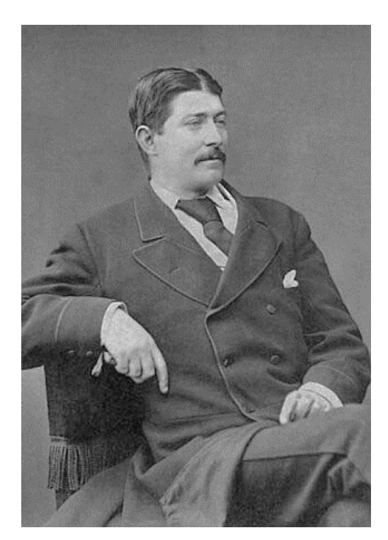
Fig. 4: Character singer George Leybourne, undated, Victoria and Albert Museum, London.