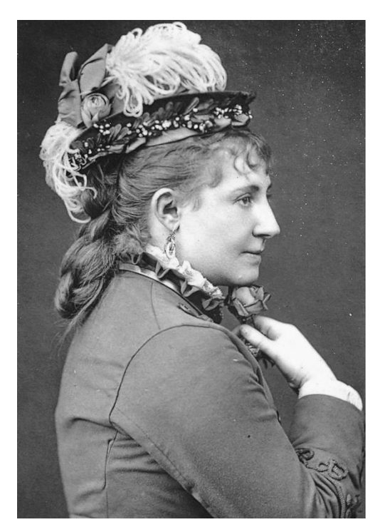
Fig. 3: Lydia Thompson of the British Blondes, ca. 1870s, photo origin unknown.