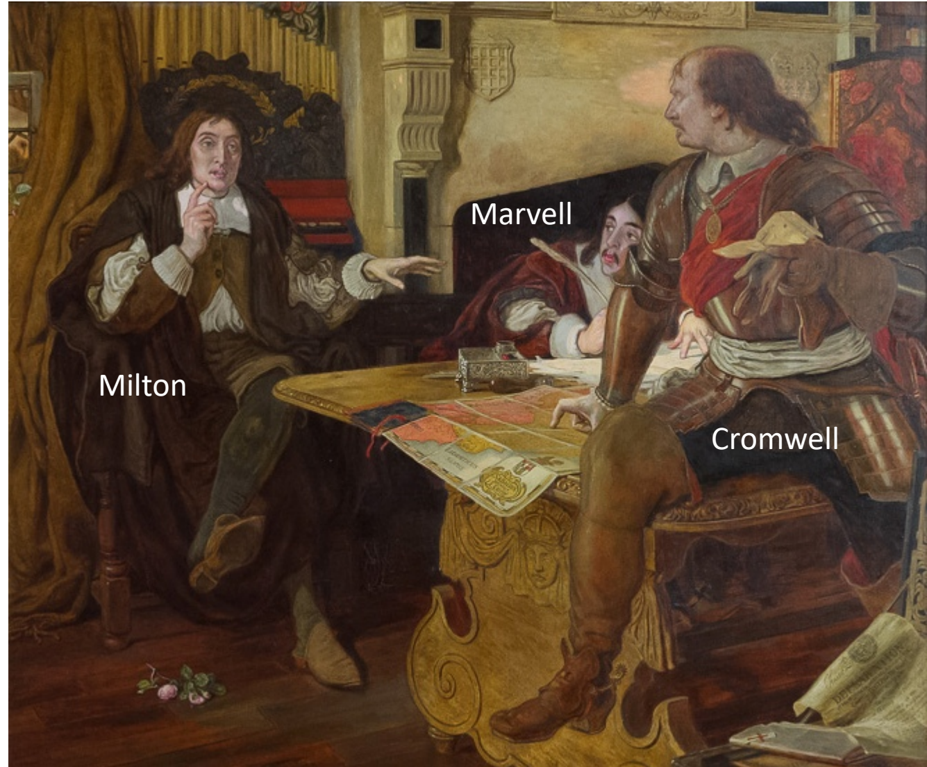
Ford Madox Brown's painting Cromwell, Protector of the Vaudois

Avenge, O Lord, thy slaughtered saints, whose bones Lie scattered on the Alpine mountains cold, Even them who kept thy truth so pure of old, When all our fathers worshiped stocks and stones; Forget not: in thy book record their groans Who were thy sheep and in their ancient fold Slain by the bloody Piedmontese that rolled Mother with infant down the rocks. Their moans The vales redoubled to the hills, and they To Heaven. Their martyred blood and ashes sow O'er all th' Italian fields where still doth sway The triple tyrant; that from these may grow A hundredfold, who having learnt thy way Early may fly the Babylonian woe.