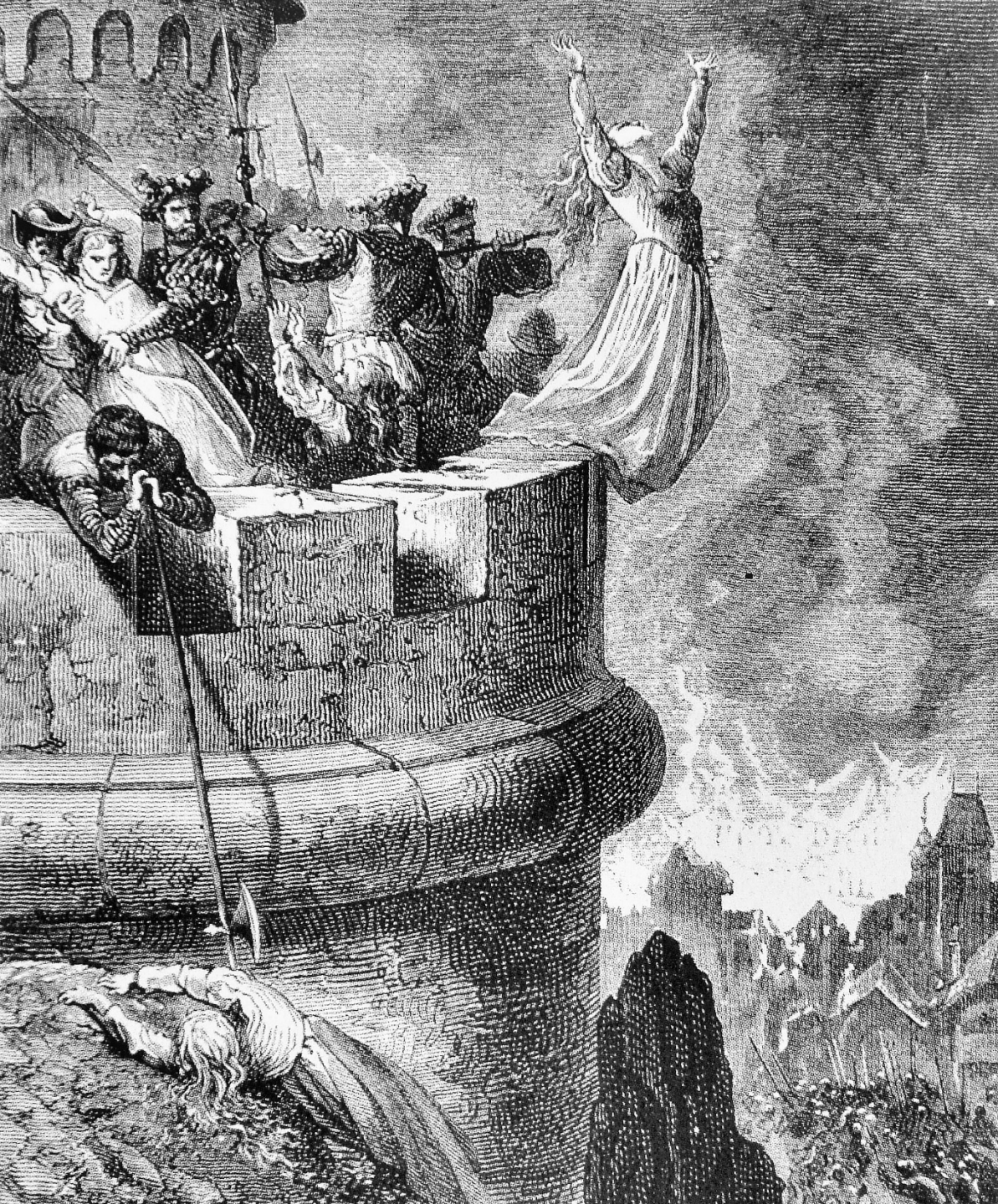
G. Dore, Massacre of the Waldensians of Mérindol in 1545