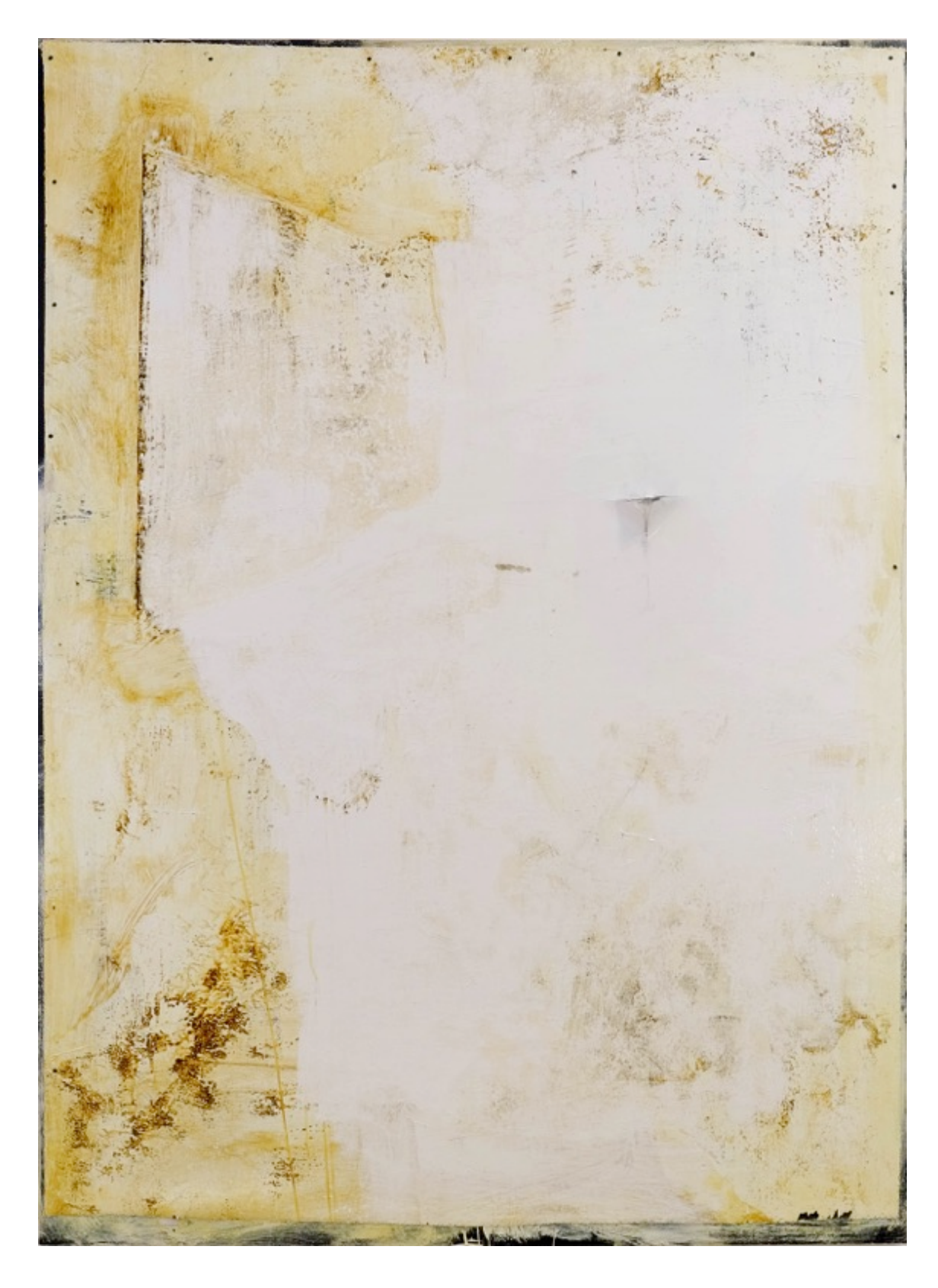
Fig. 6- Aydin Hamami, Famine , Mixed media and collage on panel, 48"x 65", 2014