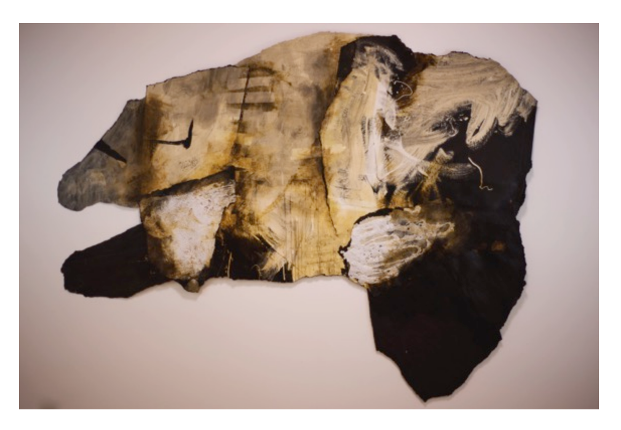
Fig. 2- Aydin Hamami, Suture #3 , Mixed media, enamel paint, on collaged asphalt felt, approx. 88"x 65", 2013