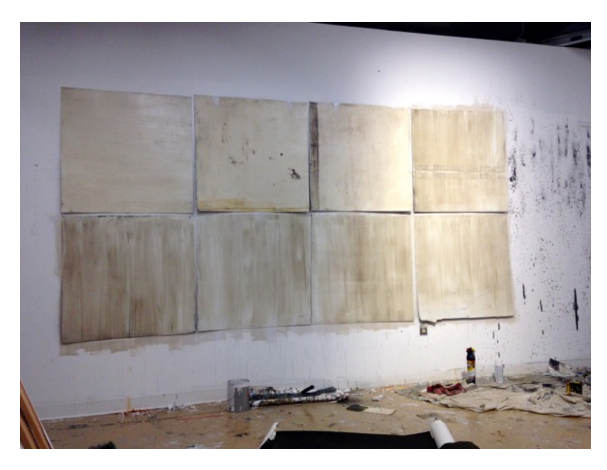
Fig. 8- Aydin Hamami, Studio in Process, spring 2015