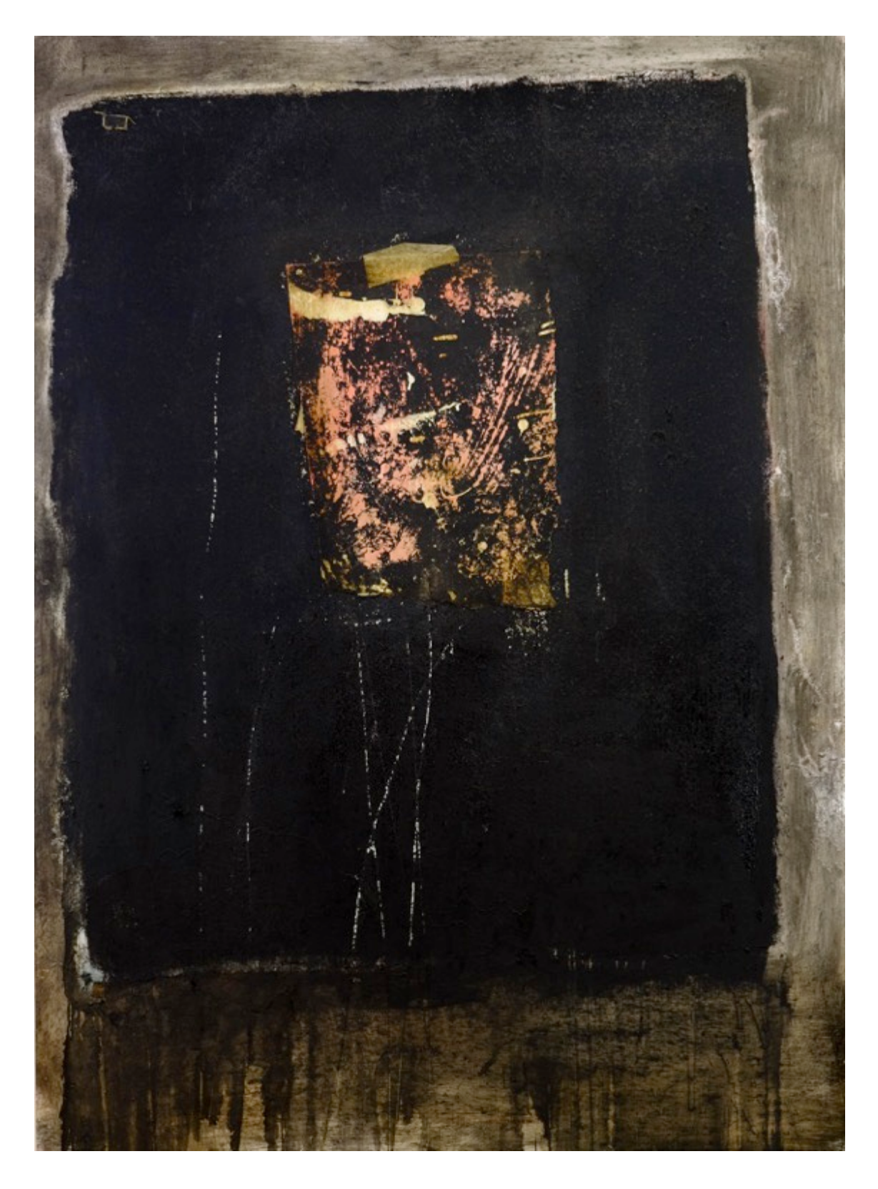
Fig. 5- Aydin Hamami, Feast , Mixed media and collage on panel, 48"x 65", 2014