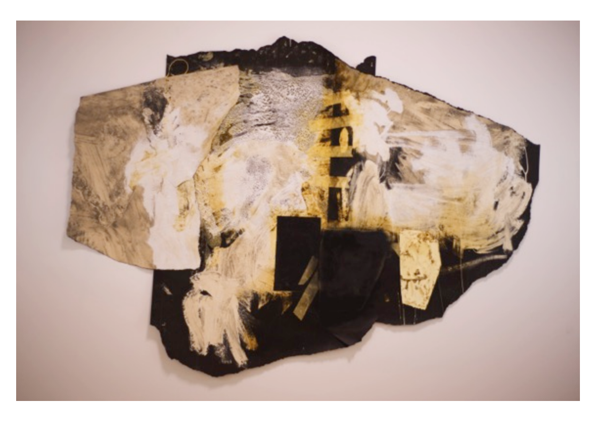
Fig. 3- Aydin Hamami, Suture #2 , Mixed media, enamel paint, on collaged asphalt felt, approx. 81"x 59", 2013

The small series of works referred to as Suture collectively, and pictured in part herein, are in many senses my first nod to the physical act of decay I am referring to. Their very bodies are made of that same city stuff that we have learned to build our world with, and that we inevitably take for granted. They are objects, first and foremost, but objects that exist in the world of painting. Here I make the distinction between things that are of painting, and the paintings that are indebted to picture-making, as I referred to earlier.