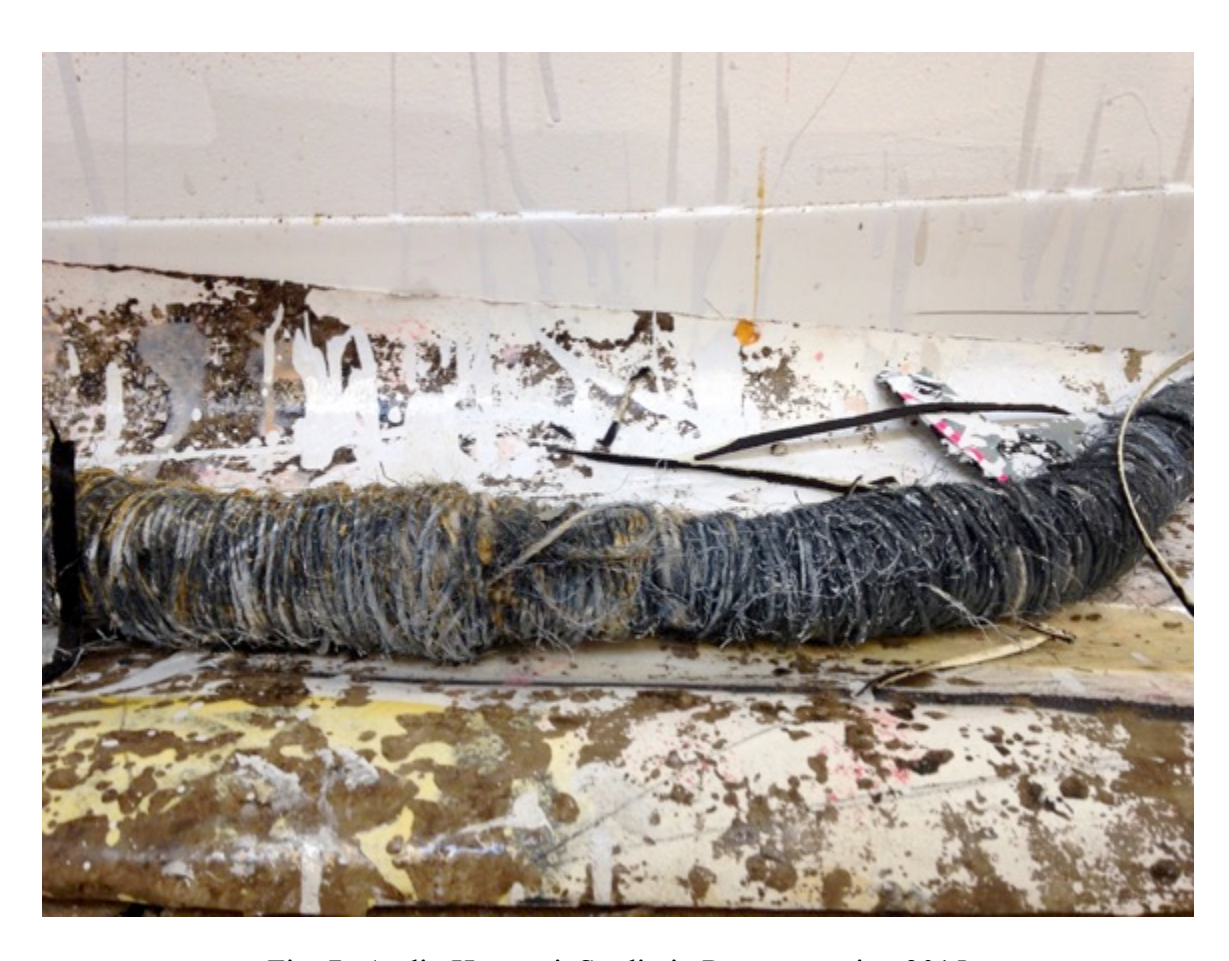
Fig. 7- Aydin Hamami, Studio in Process, spring 2015

- Nate Freeman for The New York Observer<sup>2</sup>