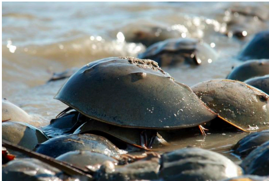
Figure 2-1: Horseshoe crab.

Horseshoe crabs were harvested in huge quantities and ground up for use as fertilizer for many years starting in the 1800s (Kreamer and Michels 2009). Later, horseshoe crabs began to be caught for use as bait for fisheries. A substance in horseshoe crab blood, LAL, is also used by the pharmaceutical industry to detect certain bacteria, another aspect of crab harvest (Kramer 2017; Kreamer and Michels 2009). Although these crabs are returned to the water after blood is removed, a number do not survive, so this process is assumed by many to contribute to population changes. While this particular use has potentially contributed to population declines, it has also spurred some concern about preservation of horseshoe crab populations due to concerns about sustained availability of LAL (Kreamer and Michels 2009).