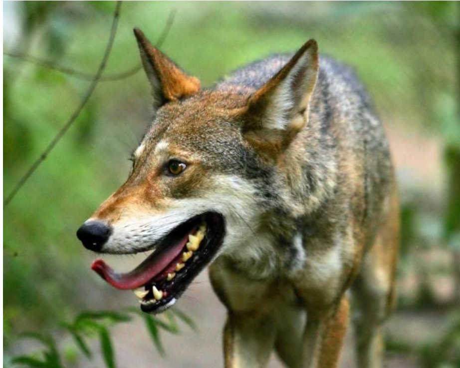
Figure 2-2: Red wolf.

Red wolves were listed as endangered at the time of the enactment of the Endangered Species Act in 1973. A population was bred in captivity and released into North Carolina in the 1990s, and the effort to reintroduce the population was largely successful with the population reaching approximately 150 in 2006 (Hinton 2018). In approximately the past 7 years, there has been increasing and widespread controversy regarding the wolf program, with substantial conflict between hunters and conservation proponents of the program. The primary cause of death of red wolves between 1987 and 2014 was gunshots, and 68% died before four years of age, presenting a major problem for the conservation of the species (Hinton et al. 2017). Therefore, human caused mortality is a major threat to red wolf conservation. However, some hunters believe that the wolves threaten deer populations and do not want the wolves on their property. This presents a particular problem because red wolves range in an area consisting of many