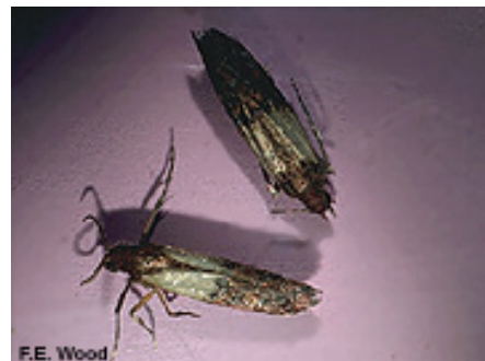
Indian meal moth (5/8" wing spread)

must be examined carefully. Adults and small worm-like larvae may be found. Unopened containers must also be checked to be sure that pests have not gained entry. Infested foods should be thrown away and the shelves cleaned thoroughly to eliminate food material and insect eggs or larvae which might be in cracks or corners. Vacuum the shelves and then wash the cupboards with warm soapy water. Do not spray any food storage areas with insecticides. Clean up any food spills promptly. Prevention is the best control for pantry pests.