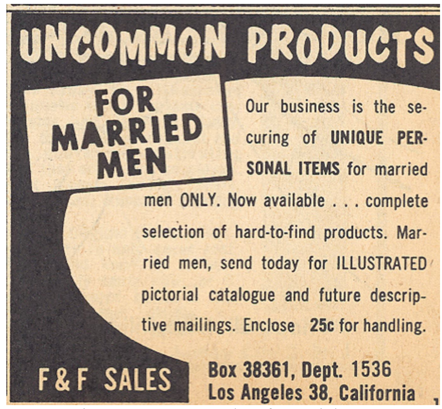
Figure 1 Uncommon Products for Married Men. "Uncommon Products for Married Men," Adam 1964 Yearbook , (1964), 113.