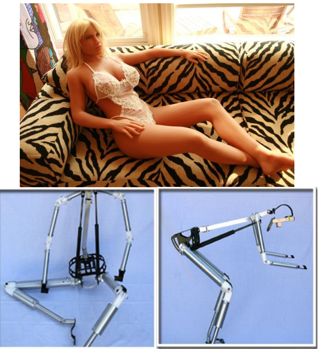
Figures 2 - 4 "Leeloo" My Party Doll