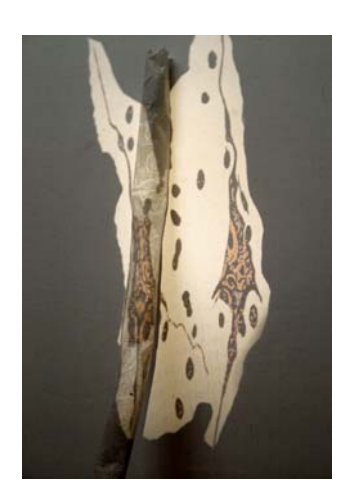
Figure 8 In the shadow, 72"x4"x4", aquatint on Korean paper, bees wax, slide projection, 2003.