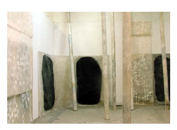
Figure 1 That Morning Series , 12'x10'x10', Aquatint on Korean paper, bees wax, 2004

The images of cells and nerves that I borrow from medical books are realistic depictions of our bodies. But these microscopic images become the elements for the imaginary (i.e. unidentified, internal) landscape because those images are not ones derived from my own body. As such, I have to depend upon my imagination. But the imagination is not separated from our nature but