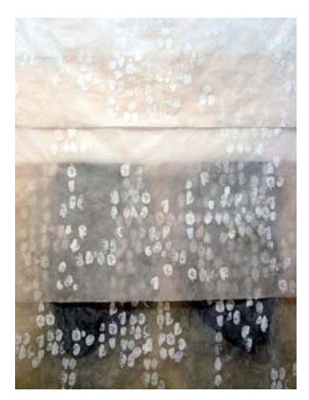
Figure 2 That MorningI ), 8'x 75", Aquatint on Korean paper, bees wax, 2004