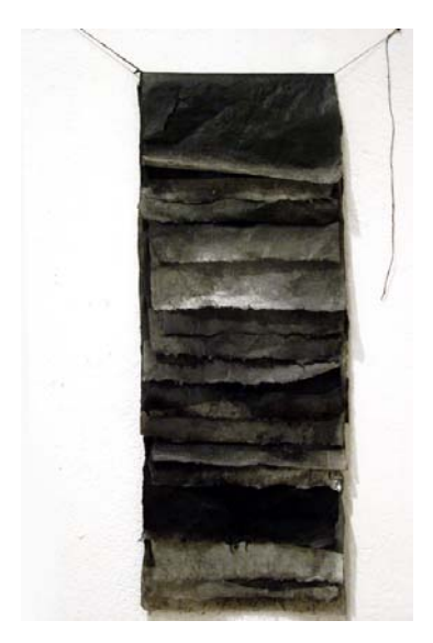
Figure 4 Getting Dark , 24"x8", Aquatint on Korean paper, bees-wax, 2004

like layers and physiological process of our body. I iron sheets of bees wax on Korean paper to create thin layers of waxed paper. The waxed papers mimic the translucent, impenetrable, but vulnerable body (i.e. skin) that resembles the surface of wax. The layers of delicately waxed papers obstruct and bury the image underneath, and at the same time transmit the echo of the image.