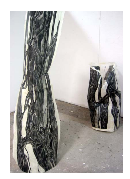
Figure 6 Nerves , 72"x 15"x 10", Aquatint on Korean paper, reinforced with fiberglass and bees wax, 2003