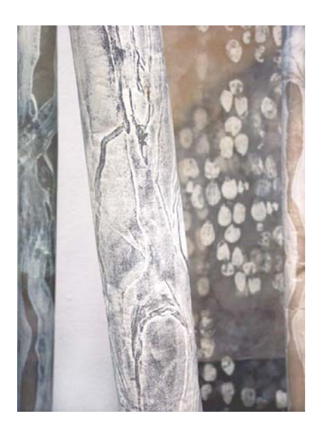
Figure 7 That Morning (detail), 12'x 12"x12"x 11pieces, 2004