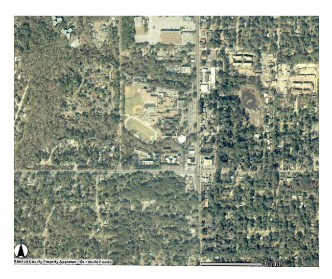
Figure 3: Sampled Schools-Gainesville High School and Eastside High School (same scale)