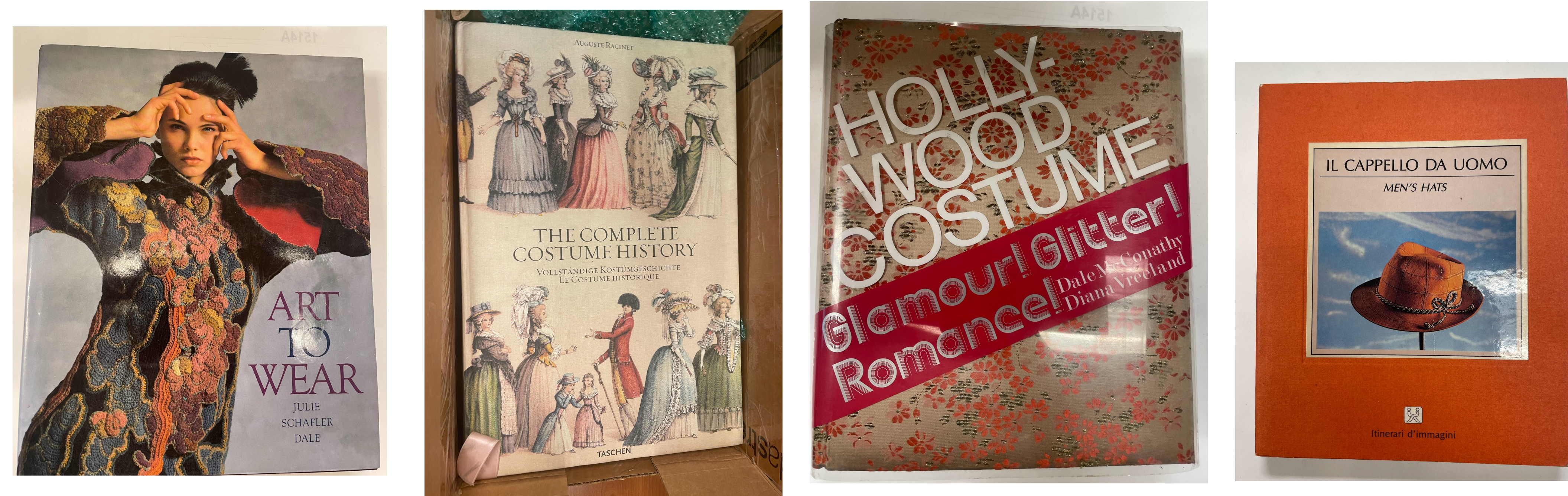
An assortment of books showcasing the breadth of the collection