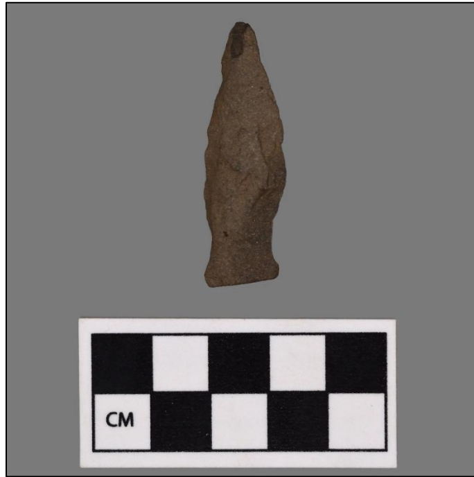
Figure 9: Orient Fishtail Point from Locus 1.

thickness for typical Orient Fishtail points (see Table 15). Only one Orient Fishtail made of hornfels was recovered from Site 119-19 in the Ap stratum (see Figure 9 below).