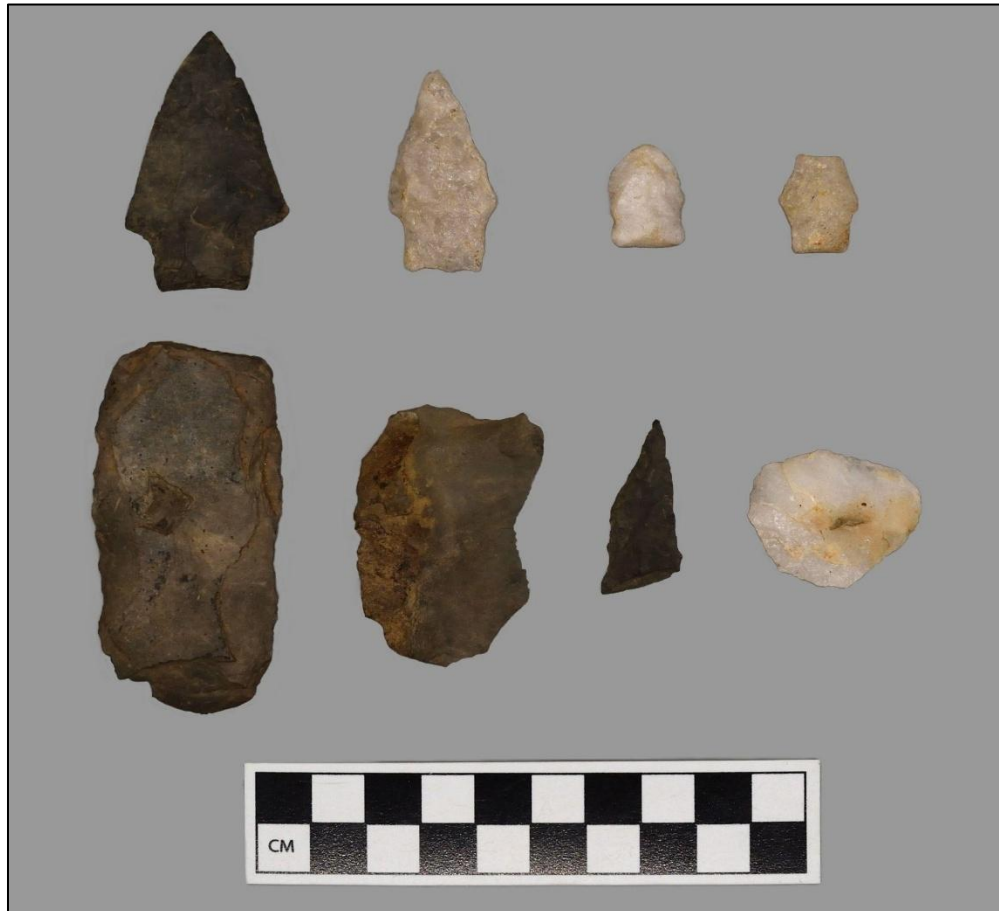
Figure 6: Lithics Recovered from Locus 2. Top row left to right Chert Atlantic projectile point, Quartz Wading River projectile point, Quartz Sylvan side-notched projectile point, Quartz Wading River projectile point; bottom row left to right Hornfels biface, Utilized chert flake, Chert drill tip, Quartz scraper.

The Phase III unit excavation recovered 2,252 lithic artifacts from Locus 2. Charcoal samples were taken for both feature 2a and 4b, but it was not analyzed for this thesis. Of the artifacts recovered there were four projectile points that were temporally diagnostic, as pictured in Figure 6.