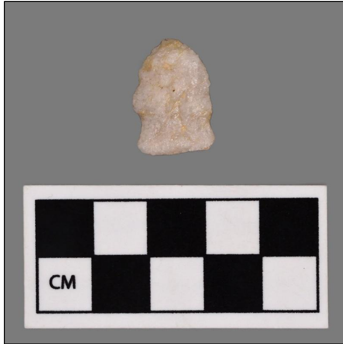
Figure 13: Sylvan Side Notched point from Locus 2.

The comparative measurements taken of the quartz Sylvan Side-Notched point recovered are provided in Table 18 below.