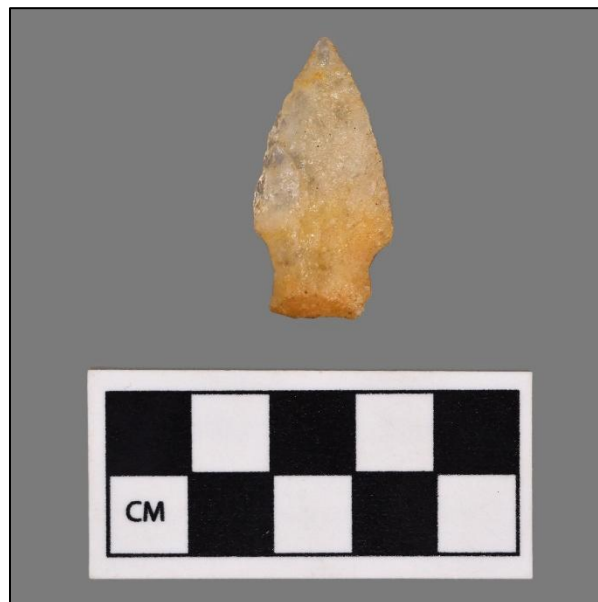
Figure 12: Lamoka point from Locus 1.

The next narrow point recovered was a Lamoka. The Lamoka is described by Boudreau as a small thick triangular bladed point with weak to moderately pronounced side notches or stemmed with sloping shoulders. While this point is similar in shape and size to the Wading River point there is a key difference; the bases are typically unworked and exhibit the cortex of the material the point is made of. The “unfinished condition of the base is a prime diagnostic feature of the Lamoka point” (Boudreau 2016: 66). Ritchie gives two different measurement ranges length, and thickness for typical Lamoka points (See Table 17). The one quartz Lamoka point recovered from Locus 1 in the Ap stratum is shown below (Figure 12).