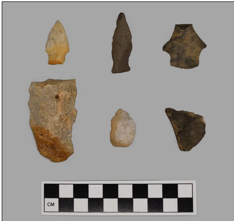
Figure 4: Lithics recovered from Locus 1: top row left to right Quartz Lamoka projectile point, Hornfels Orient Fishtail projectile point, Chert Atlantic projectile point; bottom row left to right Quartz biface, Quartz preform, Utilized chert flake.

The Phase III unit excavation recovered 456 lithic artifacts from Locus 1, a selection of which is in Figure 4 below. Of the artifacts recovered, there were three projectile points that are temporally diagnostic.