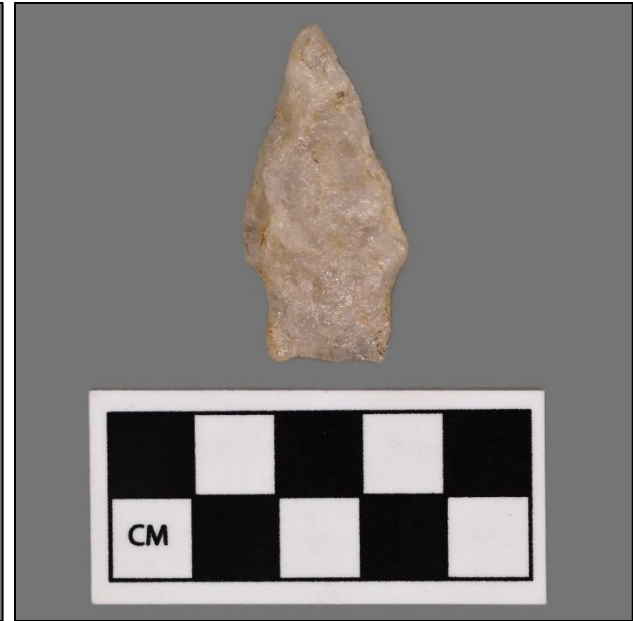
Figure 11: Wading River point from Locus 2.

Unfortunately, one Wading River point recovered from Locus 2 is missing its tip so the length measurement taken from that will not be as useful for the comparative measurements. The measurements taken regarding the Wading River points recovered are provided in Table 16 below.