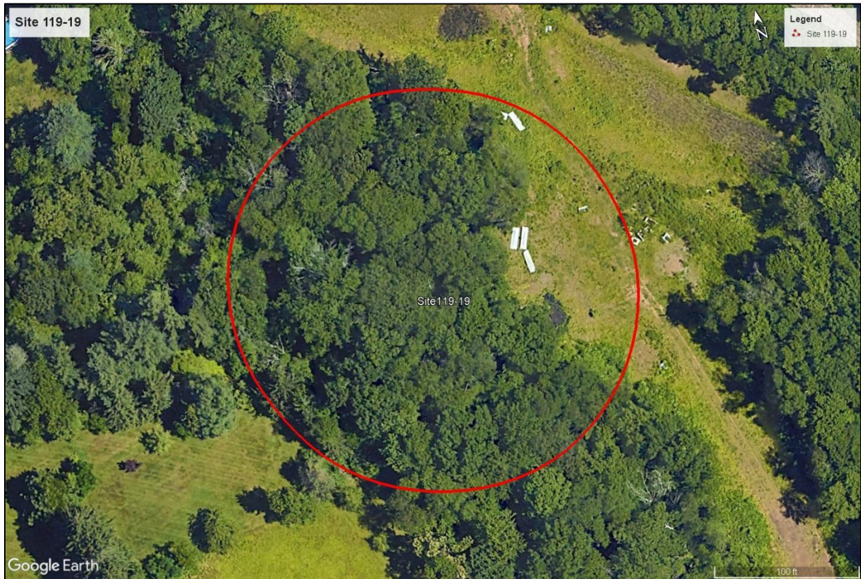
Figure 2: Aerial photo of Site 119-19.

The Phase III excavation resulted in the recovery of 80 post-European Contact period artifacts, 2,729 precontact era artifacts, and 157 ecofacts. The post-contact and ecofacts were not used in the analysis of this site. The majority of the precontact era artifacts originated from intact soil horizons. The analysis of the lithic assemblage recovered from the Phase III excavation indicates that the site is most likely the remains of a camp occupied over multiple periods. This was determined due to the quantity of flakes as well as the types of chronologically-diagnostic formal and informal tools recovered (Andrefsky 2012, 201–24). The assemblage reflects tool use, tool manufacture, tool maintenance, and tool discard activities. Specific findings for each of the two loci are presented below.