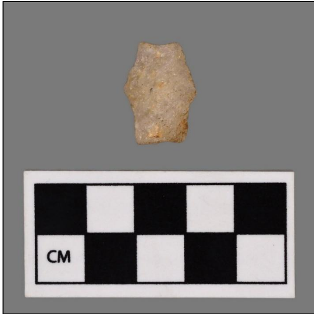
Figure 10: Wading River point from Locus 2. Photo taken by author.