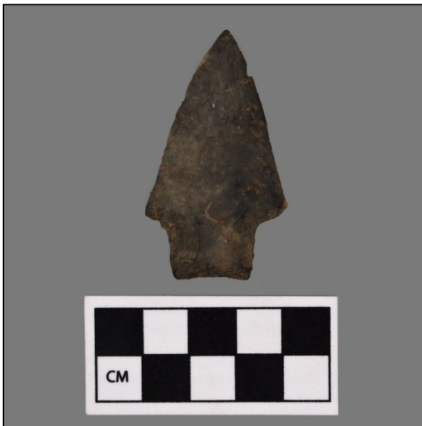
Figure 7: Atlantic point from Locus 2.

shoulder angles and straight stemmed. The Atlantic point is also thought to be an eastern variant of the Snook Kill point found in New York and identified by William Ritchie (Boudreau 2016). Boudreau gives four different measurement ranges length, width, basal width, and thickness for typical Atlantic points (See Table 14). The two chert Atlantic points recovered from this site are shown below in Figures 7 and 8. One was recovered from Locus 1, and the other was recovered from Locus 2. Both Atlantics were recovered from the Ap stratum.