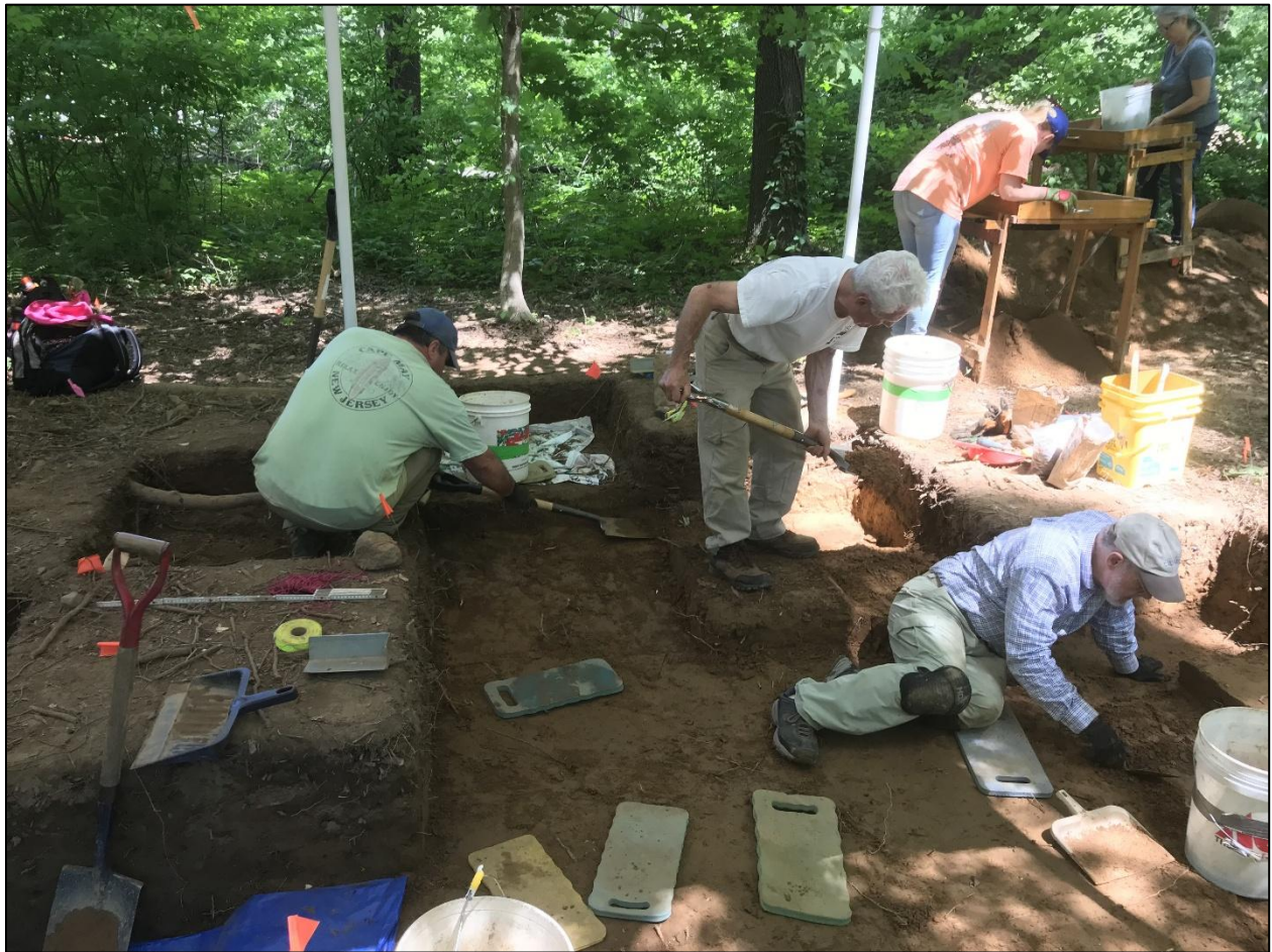
Figure 5: Unit Excavations at Locus 2.

The Phase III unit excavations of Locus 2, as seen in Figure 5 resulted in the recovery of 2,252 precontact lithic artifacts from 21 units. The assemblage consisted of cores (n=4), groundstone tools (n=1), flaked tools (n=24), debitage tools (n=25), and debitage (n=2,198).