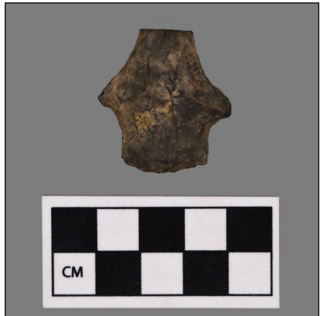
Figure 8: Atlantic point from Locus 1.