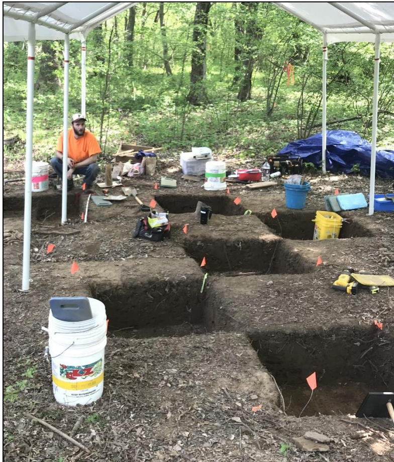
Figure 3: Unit Excavations at Locus 1.

The Phase III unit excavations of Locus 1, as pictured in Figure 4 resulted in the recovery of 456 precontact lithic artifacts from eight units. The assemblage consisted of cores (n=2), ground stone tools (n=2), flaked tools (n=7), debitage tools (n=7), and debitage (n=438).