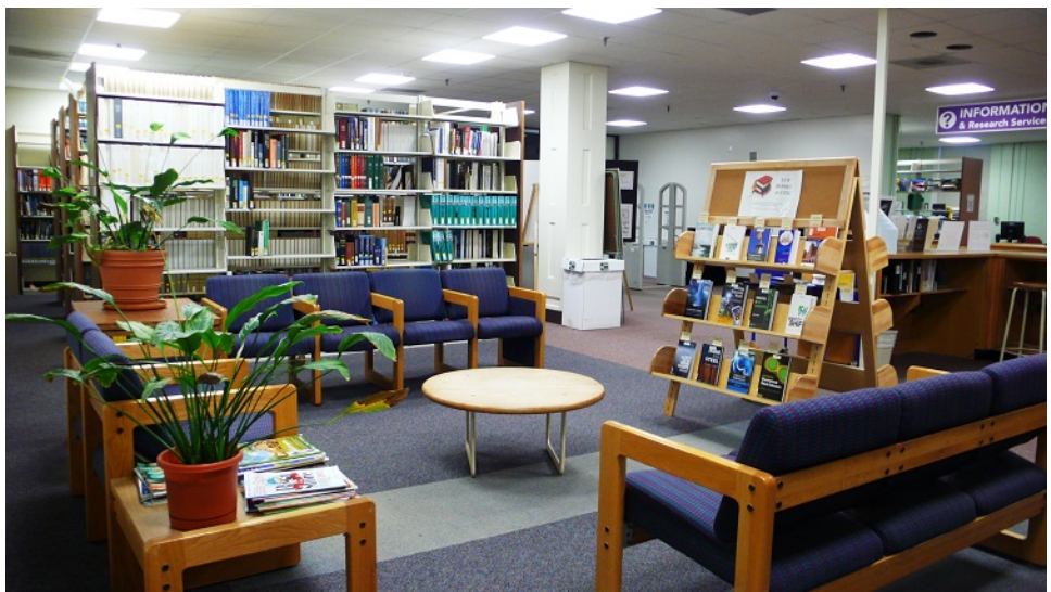
Figure 2: EPSL reference area before being renovated

regular circulating collection. Additional seating has also been added for students to collaborate, study, and, even occasionally, sleep. New technology has also been added to the space, including a TV monitor, which is used for EPSL's STEAM Salon talks and display student projects, and 3D printers, which is another popular service at EPSL. Renovations are planned at other locations to develop more collaborative and learning spaces for users.