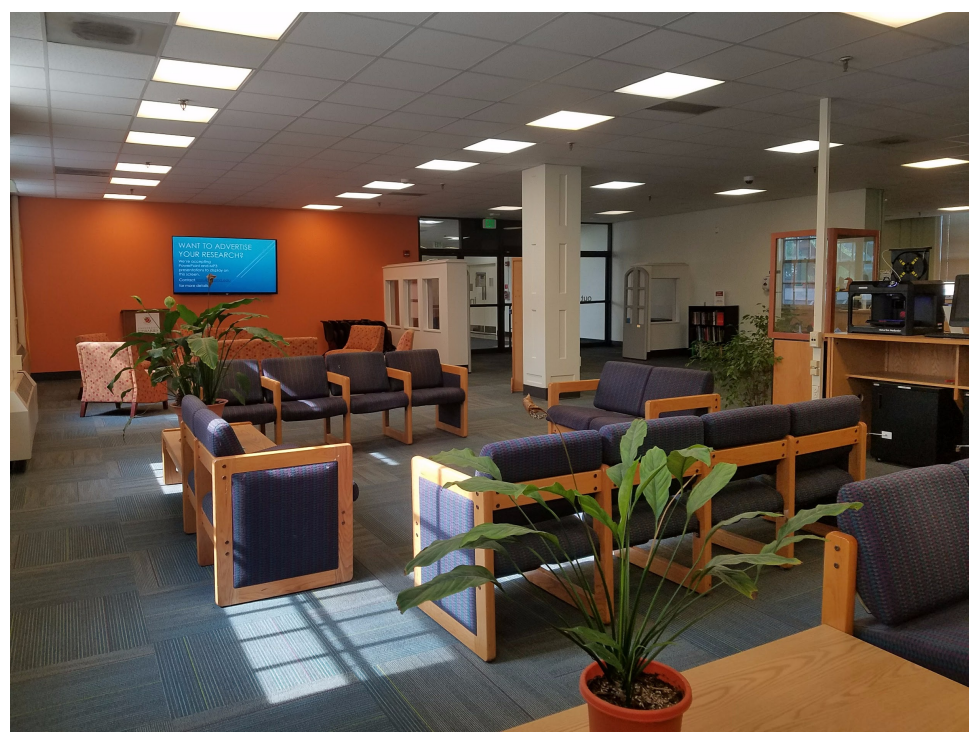
Figure 3: EPSL's completed renovation, including new seating and new technology