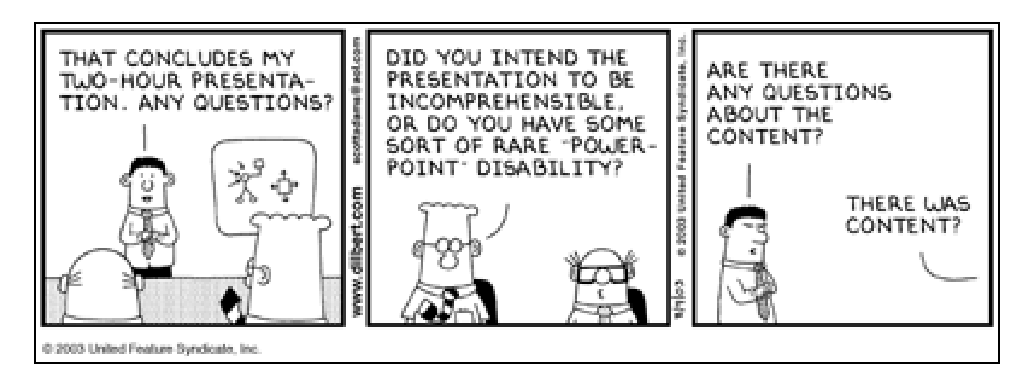
Figure 2-2 Cartoon about ineffectiveness of PowerPoint

Cartoonists mocked the ineffective PowerPoint presentations (see Illustration 1 for an example from Dilbert) and the boring and dull nature of PowerPoint (see exhibit 2 from Cartoonbank.com).