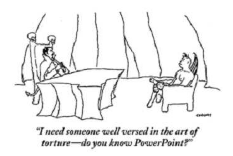
Figure 2-3 Cartoon about ineffectiveness of PowerPoint

The backlash against PowerPoint continued with the growing number of articles published by media experts, librarians, journalists and academics. Articles such as "Is PowerPoint the Devil?" (Keller, 2003), "PowerPoint is Evil" (Tufte, 2003b), "PowerPoint Makes You Dumb" (Thompson, 2003), "End PowerPoint Dependency Now!" (Bell, 2004), "Learning, One Bullet Point at a Time; Pupils Who Can't Even Spell 'PowerPoint' Can Use It as Slickly as any C.E.O." (Guernsey, 2001), and "Death by Bullet Points" (Heavens, 2004) harshly criticized the dependence on PowerPoint slides and explained some of the problems that lead to boring, ineffective, presenter-centered presentations. The PowerPoint supporters and the don't-blame-the-tool camp were quick to respond to the anti-PowerPoint advocates with articles such as "PowerPoint Doesn't Make You Dumb" (Gunderloy, 2003), "Bullet Points May Be Dangerous, but Don't Blame PowerPoint" (Simons, 2004), and "In Defense of PowerPoint" (Holmes, 2004). They opposed the idea that PowerPoint itself is flawed and instead asserted that it was the users