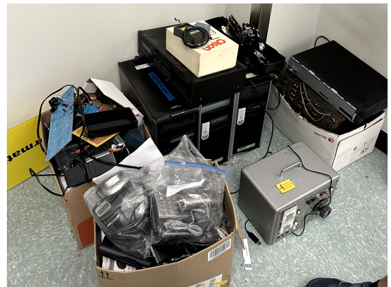
Figure 4.1: (A) Organized collection of beer caps repurposed into various products; (B) Repurposed filament boxes transformed into labeled component shelves; (C) A precisely organized and labeled rack from a community makerspace; (D) Electronics waste including chargers, CPUs, machines etc.

These storage boxes are designed for members to put their ongoing projects in. You know, a lot of these projects take a long time to complete, so people need places to store them. But some of these boxes have been sitting here for a long time, and we don't really know if the projects inside are finished or unfinished. I don't want to throw away anyone's project before confirming with them, so for now, they're still here. But eventually they may just become trash.