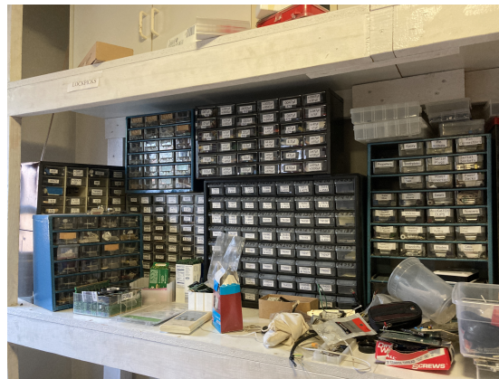
Figure 4.2: (A) Organized collection of beer caps repurposed into various products; (B) Repurposed filament boxes transformed into labeled component shelves; (C) A precisely organized and labeled rack from a community makerspac.