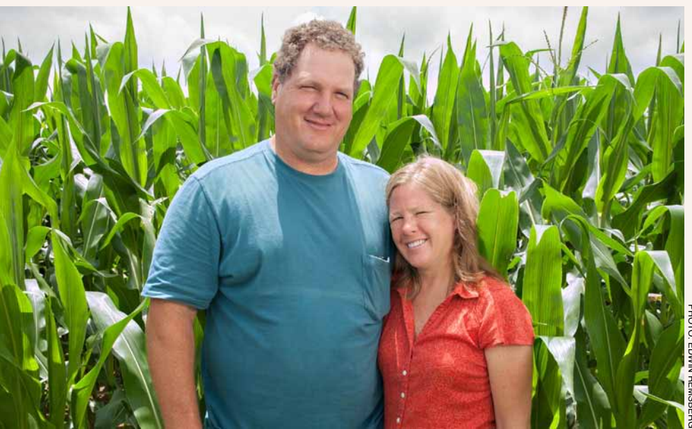
Supplemental Coverage Option operates by mimicking a producer's individual crop insurance coverage and increasing the protection to 86 percent of the producer's APH yield and price election. SCO became available with the 2015 crop year in select Maryland counties.