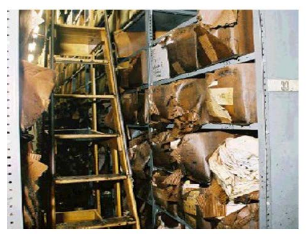
Donors of $10 or more will receive a "I GAVE TO SAVE" badge ribbon