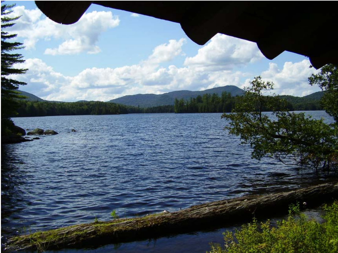
View Of Newcomb Lake From The Great Camp Santanoni Boathouse