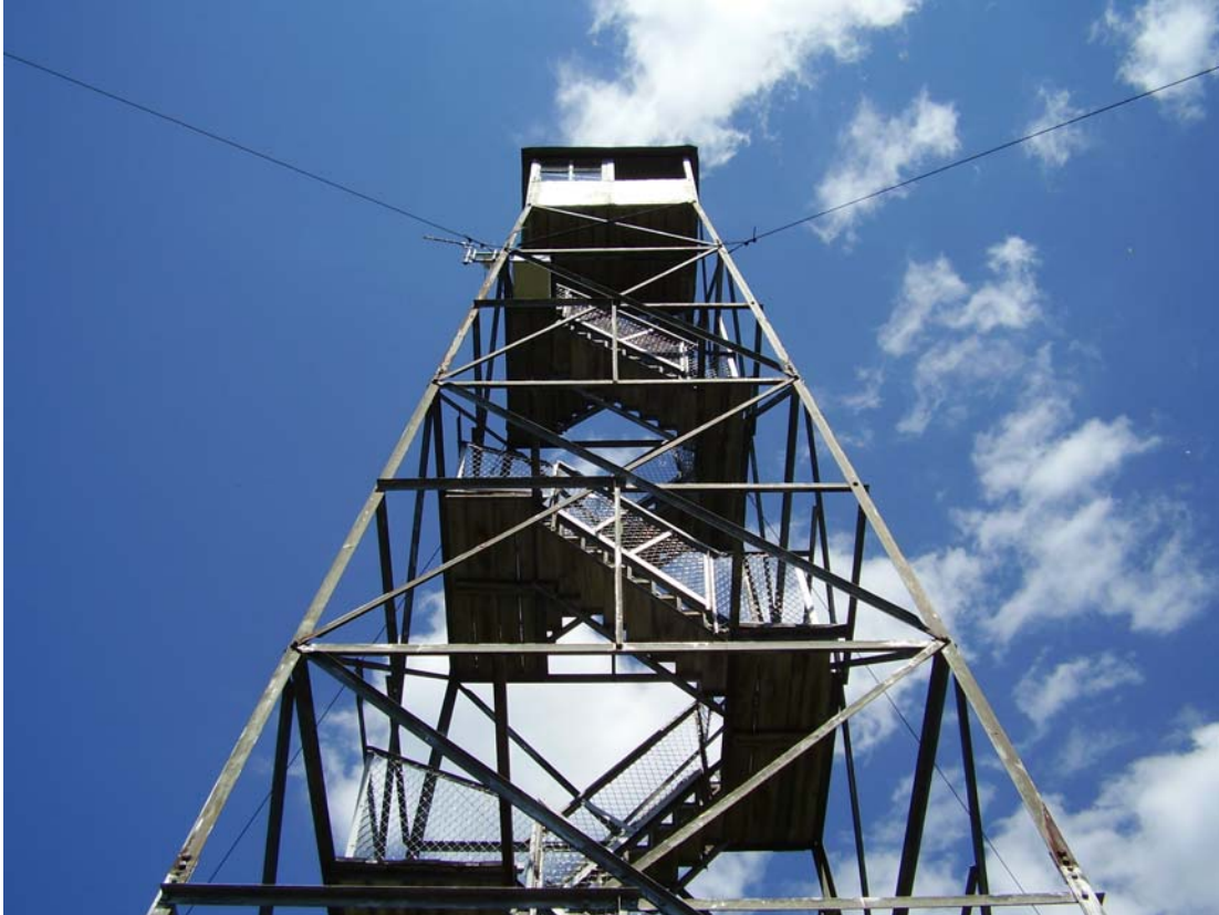
Goodnow Mountain Fire Tower (Figure #5)

States, and one of only three places in the world, to have ever hosted the Winter Olympics on two different occasions. Lake Placid has numerous historic resources including the site of what is arguably the greatest victory in American sports history, the United States men's hockey team's victory over the Soviet Union in the 1980 Winter Olympics.