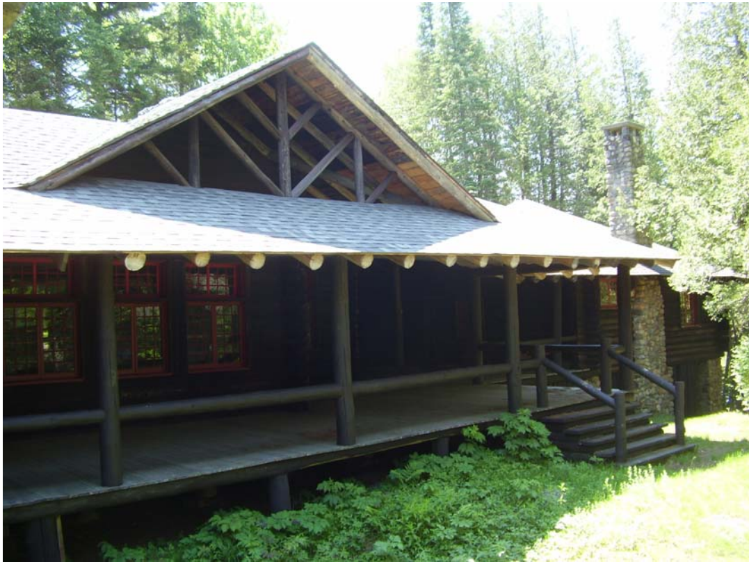
Main Camp Irimoya Roof Gable (Figure #11)

weather was not cooperating. The covered porch system added another 5,000 square feet to the 5,000 square feet of interior space found under the Main Camp's large roof. A 16,000 square foot roof covering the Main Camp remains a striking sight to behold. 25 Unique irimoya gables are found in several sections of the Main Camp's gabled roofline. The irimoya gables allowed for natural light to break through both the forest and the extensive roofline, and into each of the rooms at the Main Camp (all of which faced westward).