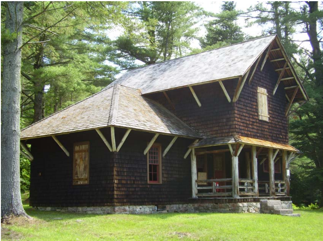
Great Camp Santanoni Gardener's Cottage (Figure #15)

Edward Burnett, the same man who designed the farm at the Vanderbilt's Biltmore Estate in Asheville, North Carolina. Composed of numerous individual buildings, the fully functional farm featured a creamery, a barn, a smokehouse, a vegetable garden and three buildings (Farm Manger's Cottage, Gardner's Cottage, and Herdsman's Cottage) that served as places of residence for staff. Santanoni's farm was built from 1902-1908 and outside of the Farm Manager's Cottage, a Sears Catalog Home (and one of the last buildings added to the great camp as a whole), all of the buildings at the farm were built in the Adirondack Rustic style. The farm at Santanoni was for its time state of the art.