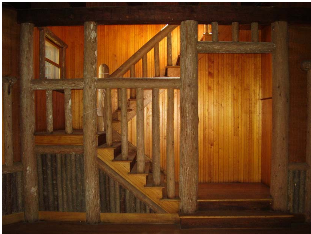
Main Lodge Stairway (Figure #12)

were harvested on the Santanoni Preserve, but not close enough to the Main Camp as to disturb its setting. 26 The interior spaces at the Main Camp were equally amazing. Peeled birch bark served as the wallpaper for the upper portions of the great room in the Main Lodge. Split log paneling was utilized to clad the exterior faces of several doorways throughout the Main Camp and panel portions of the great room in the Main Lodge. The stairway railing leading from the first floor to the second floor of the Main Lodge was made out of individually selected tree trunks.