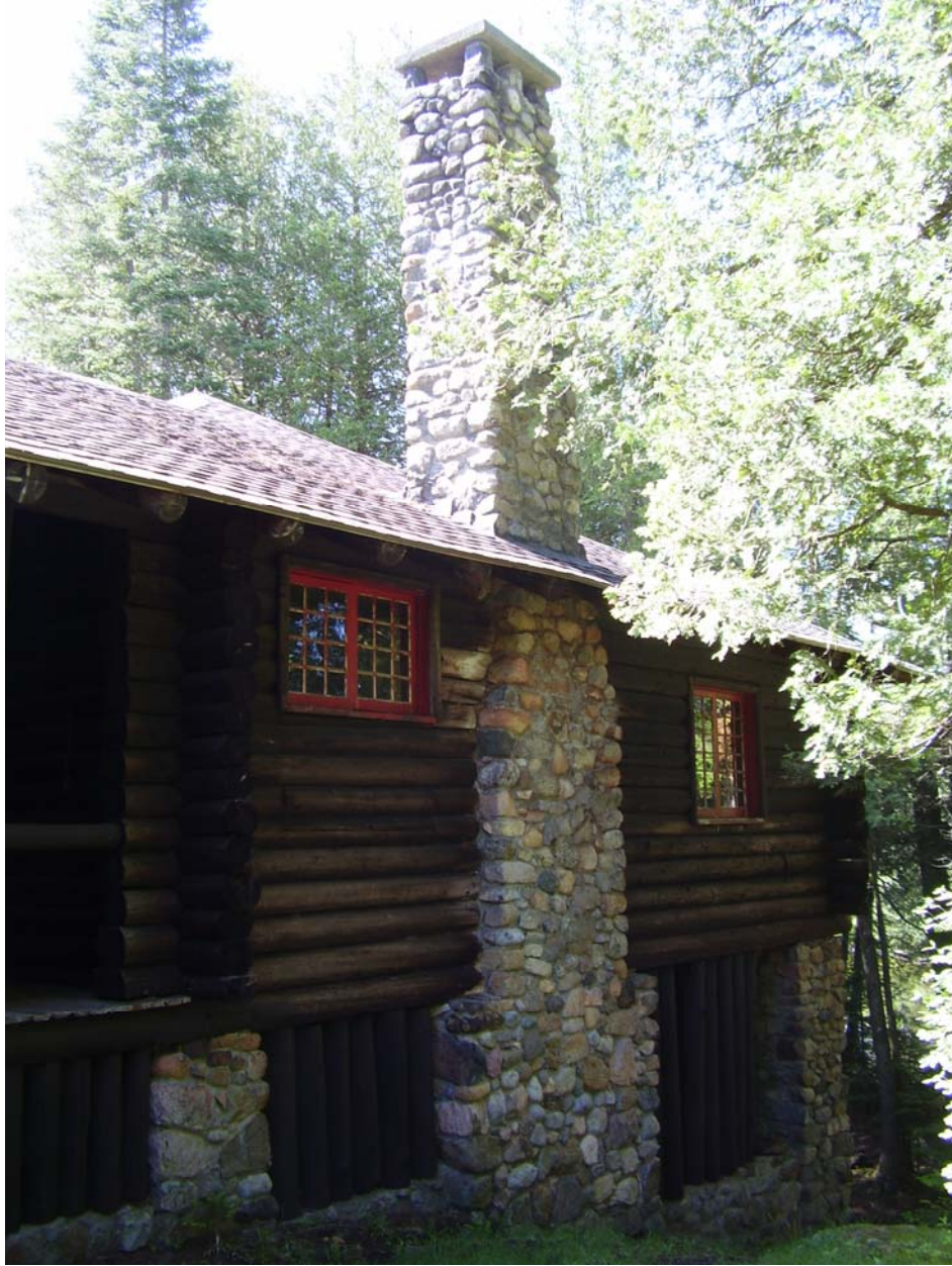
Main Camp Sleeping Lodge (Figure #22)