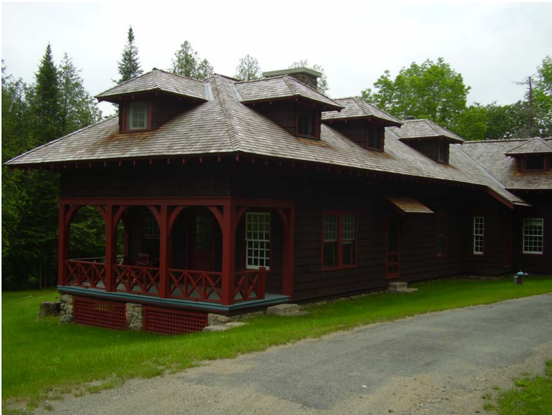
Great Camp Santanoni Gate Lodge Rear (Figure #18)

Aldrich. While overall the building was designed in the Adirondack Rustic style, it was defined by the large Richardsonian Romanesque field stone archway that served as the “gate” to Great Camp Santanoni. Once construction was completed it served as the primary entry into Great Camp Santanoni, and what a grand entrance it was. Visitors would have entered the Santanoni Preserve via the road connecting the preserve to the Town of Newcomb. Almost immediately after entering the property visitors crossed a bridge that spanned the Harris Lake Inlet and would follow the road around as it passed under the imposing archway that was part of the Gate Lodge.