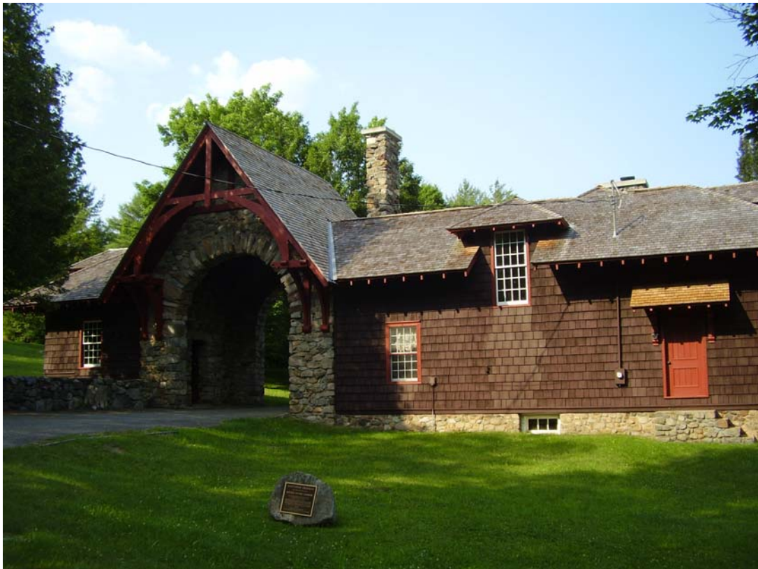
Great Camp Santanoni Gate Lodge (Figure #17)