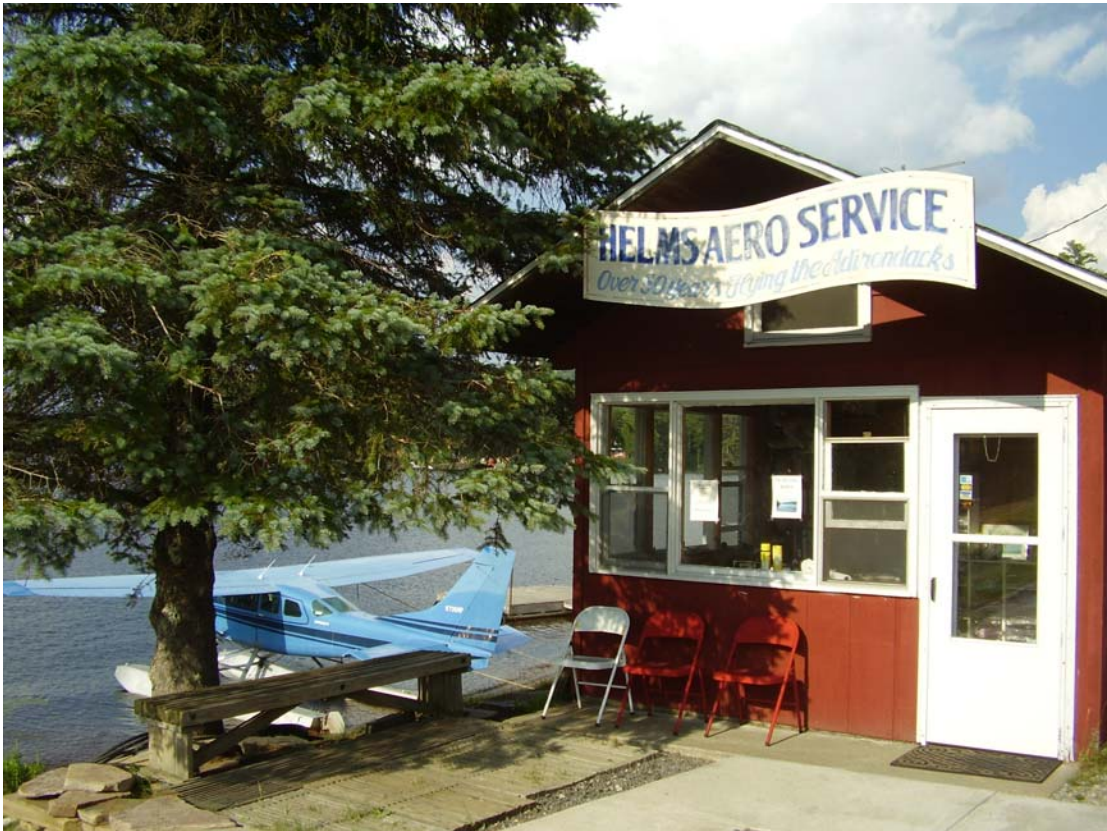
Adirondack Roadside Architecture (Figure #4)

but there are still many more, including Great Camp Santanoni, worth researching and saving. A more deliberate and conscious effort must be made by researchers both within and outside the field of historic preservation to illuminate the threats facing historic resources in Adirondack Park. As part of this effort it should be made clear that not all of the at-risk historic resources within Adirondack Park are of the same high-style as the numerous great camps like Santanoni. The situation at Santanoni merely highlights a much larger issue. If a high-style, state-owned historic resource like Santanoni is having trouble being properly managed by New York State, then the question of what is being protected and preserved becomes a much more relevant and tangible issue.