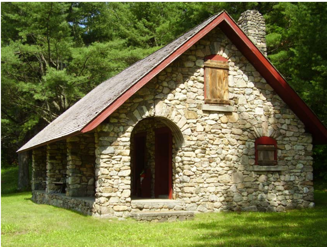
Great Camp Santanoni Creamery (Figure #14)