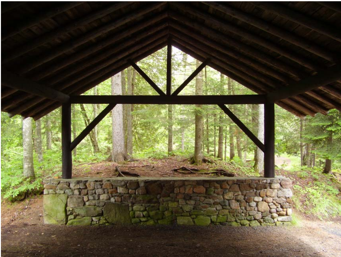
Main Camp Porte-Cochere (Figure #21)

Twenty years of negligence and mismanagement (in the form of delayed decision making) had left many of the buildings at Santanoni fighting for their lives. The NYSDEC's policy of neglect, while certainly not as deliberately destructive as their policy of building removal by fire, was taking its toll, and water and gravity were doing all the work.