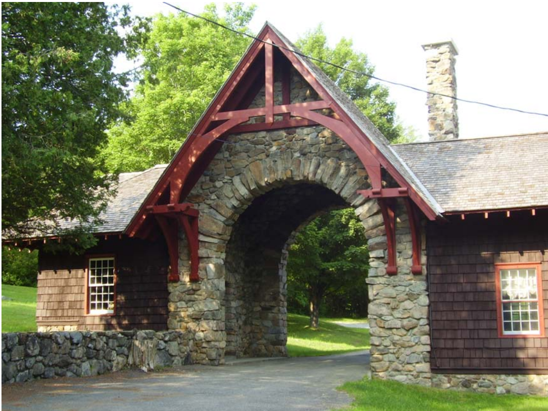
Gateway To Great Camp Santanoni (Figure #1)

This project explores the management of historic resources, specifically, historic resources located in New York State's Adirondack Park and located on public property. The chapters that follow tell the story about the laws and policies that have failed a unique, state-owned historic resource within Adirondack Park named Great Camp Santanoni. By focusing on the unique story surrounding the construction, ownership, neglect, and preservation of this particular Adirondack great camp one will gain a better understanding of some of the larger issues surrounding the preservation of state-owned historic resources within Adirondack Park. In many ways New York State's stewardship of Santanoni, a National Historic Landmark, serves as a guide of what not to do when trying to effectively manage state-owned historic resources.