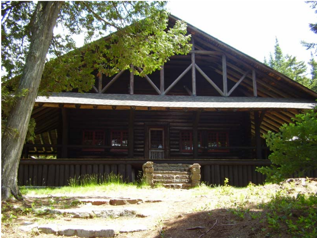
Great Camp Santanoni Main Lodge (Figure #10)

supposedly originally derived from the local pronunciation of the words “Saint Anthony.” The Pruyns owned over 12,900 acres of land within the Santanoni Preserve and they took advantage of the many opportunities their property offered them (camping, hiking, and fishing). They were especially avid fishers; notches were added to the exterior of the Main Lodge to allow them a stylish way to store their fishing rods whenever they were done fishing for the day.