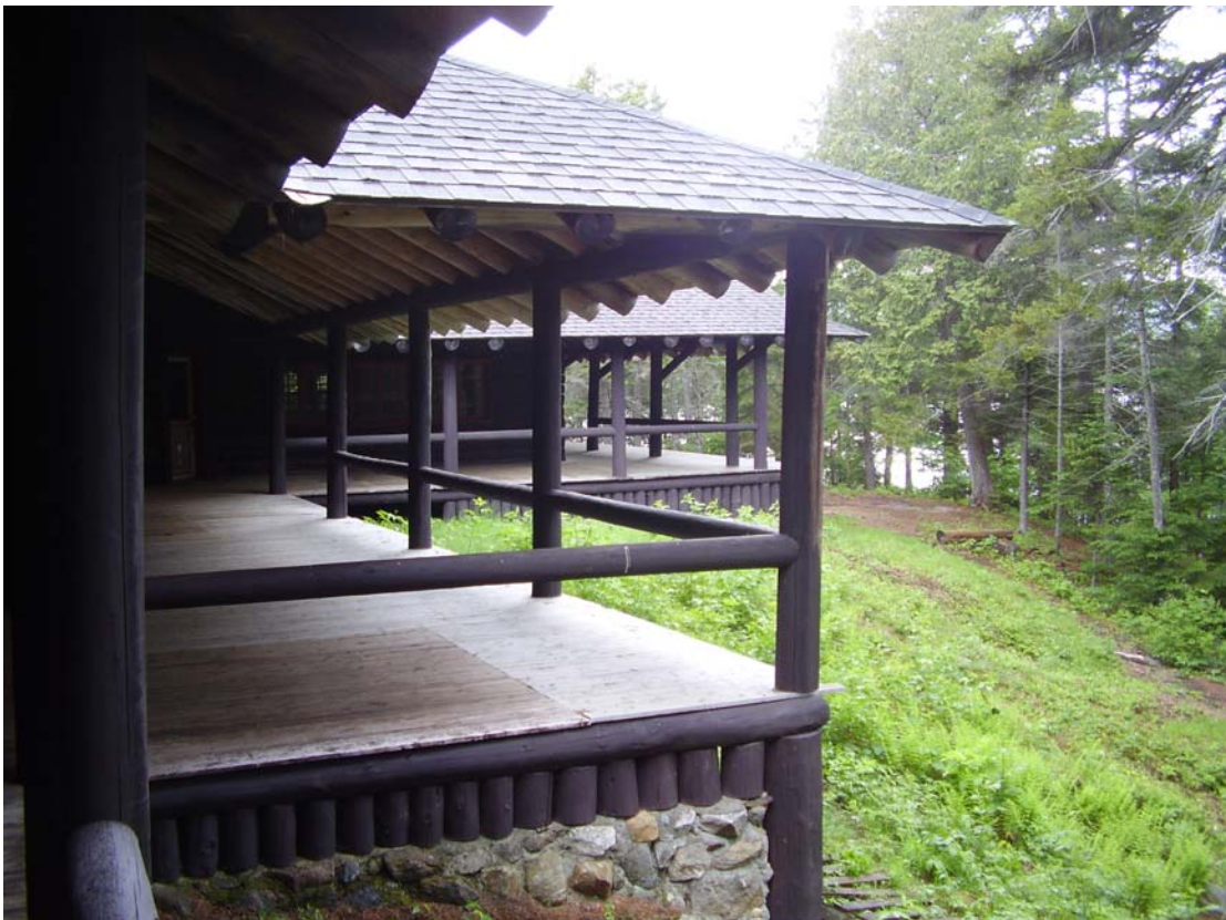
Great Camp Santanoni Main Camp Veranda (Figure #2)

The paper concludes with a chapter, Achieving Balance , dedicated to presenting solutions to the problems caused by New York State's mismanagement of Santanoni, with the hope that such an analysis will help prevent some of the same problems from happening again in the future (involving different historic resources). These are problems that illustrate a much larger issue, sooner rather than later New York State is going to have come to grips with the fact that part of what makes Adirondack Park such a wonderful place are the people who live, work, and visit there. To not protect the places that together tell their story is to deny a simple truth, that Adirondack Park is and was a place of both beautiful natural creations and beautiful cultural creations, both of which deserve to be cherished and protected "forever."