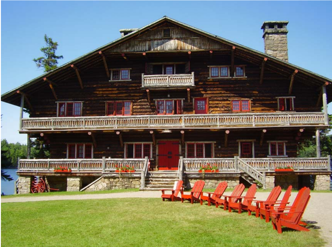
Great Camp Sagamore Main Lodge (Figure #7)

of the first buildings completed at Sagamore was the Main Lodge, a magnificent Adirondack Rustic building that proudly exhibits various aspects of its Swiss Chalet style roots, which is no accident. As a young man Durant traveled extensively in Europe and it is certainly possible that Durant's work in the Adirondacks was influenced by something he saw or experienced during those travels.