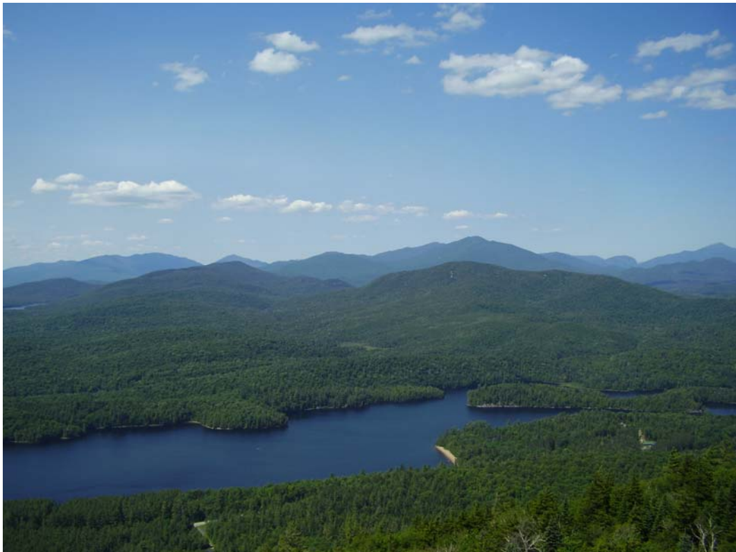
View From Goodnow Mountain Fire Tower (Figure #6)

During the late nineteenth- century the Adirondacks became synonymous with the idea of wilderness and it was this notion, of the Adirondacks as wilderness that transformed the region into a major tourist destination. This transformation occurred for good reason. Adirondack summers are wonderful; the days are comfortably warm with virtually no humidity and nights are crisp, but not cold. Mountains appear seemingly endlessly stretching outward and upward in every direction. Water carves its way through the landscape in the form of numerous streams, rivers, and lakes. It truly is a perfect setting. A clergyman from Boston named William H. H. Murray, after visiting the Adirondacks over the course of several summers, wrote of its beauty in Adventures in the Wilderness , first published in 1869.