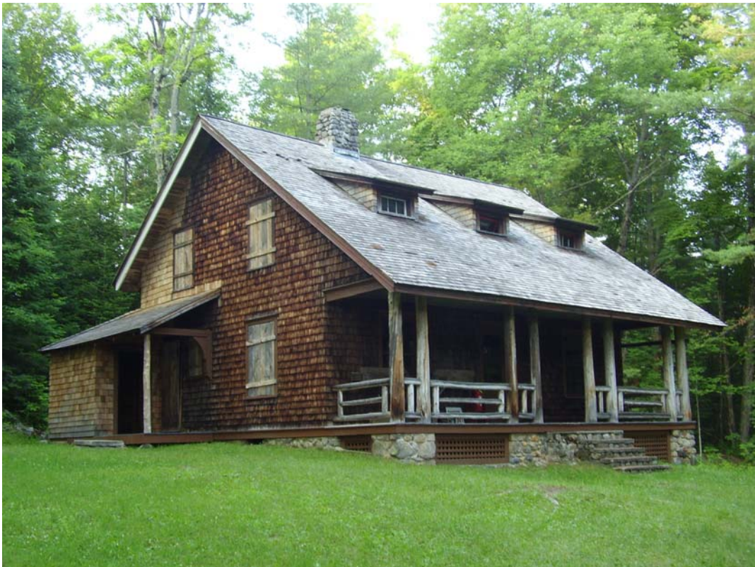
Great Camp Santanoni Herdsman’s Cottage (Figure #16)

provided fresh spring water to several of the buildings at the farm. At the barn, a thirsty cow “could push its nose into a ceramic bowl to activate a valve that filled the bowl with spring water.” 30 The barn at Santanoni also featured a vertically oriented silo and although the Adirondack summers were too short to allow corn to properly ferment and thus the silo never functioned as intended, the silo’s vertical orientation was still a relatively ground-breaking design at the time of its construction. Once the Farm Complex was completed, it featured a wide range of farm animals including cows, pigs, sheep, chickens, and ducks. Santanoni’s farm produced enough milk, ham, and eggs that some of it was sold.