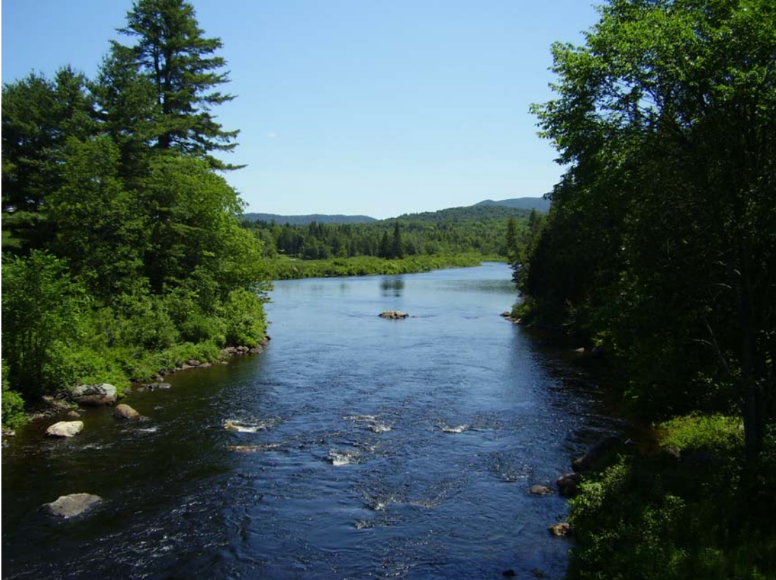
Hudson River In Newcomb, New York (Figure #9)