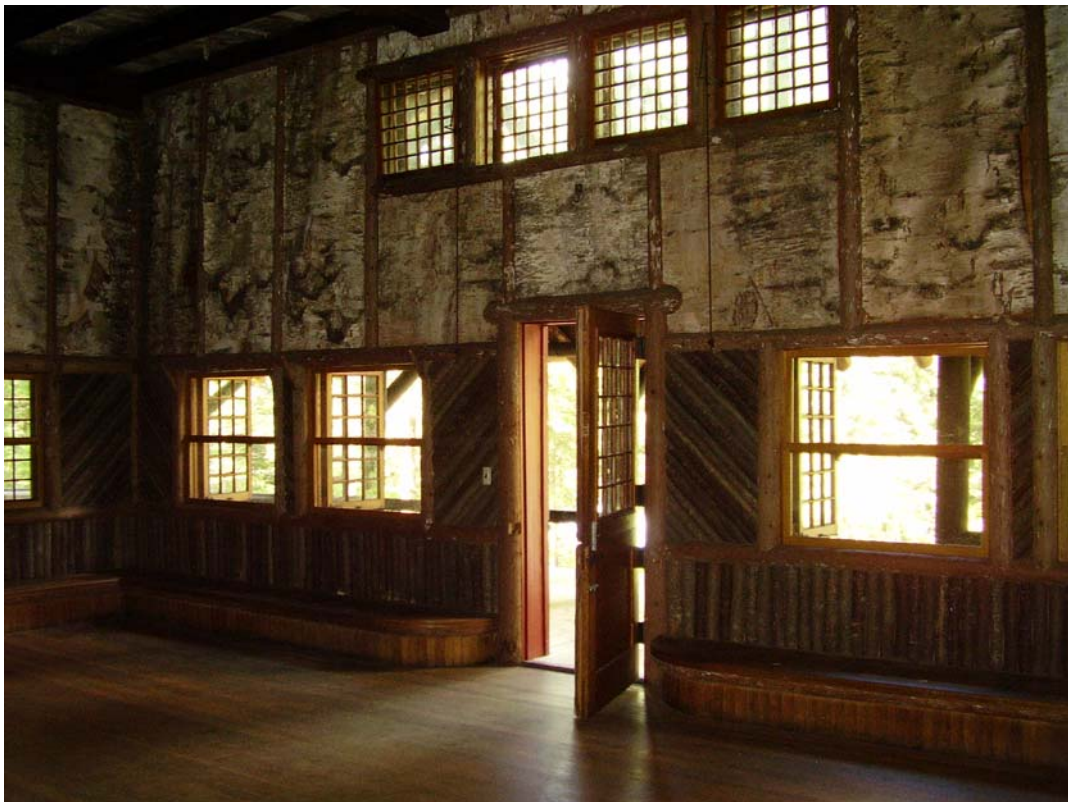
Main Lodge Great Room (Figure #13)

believed to be one the primary reasons that the massive three story building has survived. Within the Main Lodge the Pruyns enjoyed the warmth of the fire and the sound of the piano. The sleeping quarters located to each side of the Main Lodge utilized a shared fireplace and a shared bathroom with neighboring rooms. All of the bathrooms at the Main Camp featured full indoor plumbing. The initial plumbing arrangement was extraordinary. Water was gravity feed from a small spring located (at a slightly higher elevation than the Main Camp) all the way across Newcomb Lake through underwater pipes. After this system failed (the underwater pipes corroded) a small Pump House was built just down the hill from the Main Lodge on the edge of Newcomb Lake.