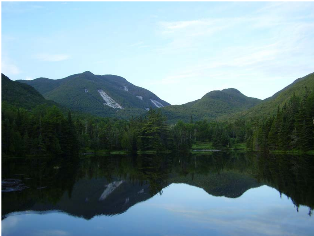
Early Morning View From Marcy Dam (Figure #3)

The implications of this constitutional promise are broad and have an impact on activities ranging from basic trail maintenance to one of the focuses of this paper, the preservation of historic sites located on public lands. The struggle to balance nature and culture in Adirondack Park is nothing new. From the beginning maintaining a balance between these two compelling forces was destined to be a struggle. When Adirondack Park was created it was “a park like no other park the world had ever seen - a park that was a complicated mix of public and private property.” 2 Since that time, finding equilibrium between culture and nature has been an issue of paramount importance for generations of permanent residents, summer residents, and visitors. Much has been written about this struggle, but few real permanent solutions have been found.