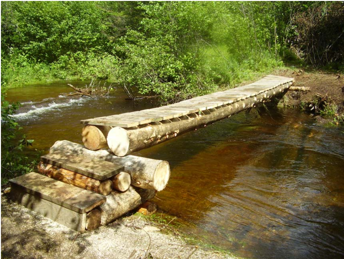
Human-Made Footbridge (Figure #20)

to the way in which they handled their stewardship of Great Camp Topridge. Topridge was given to New York State by the Marjorie Merriweather Post Foundation in 1974 and from the beginning the state made clear their intention to utilize the camp as a site for conferences and other meetings. In 1978, the state utilized Topridge for a meeting between the New York State Office of Parks and Recreation and the New York State Office of Environmental Conservation (NYSDEC).