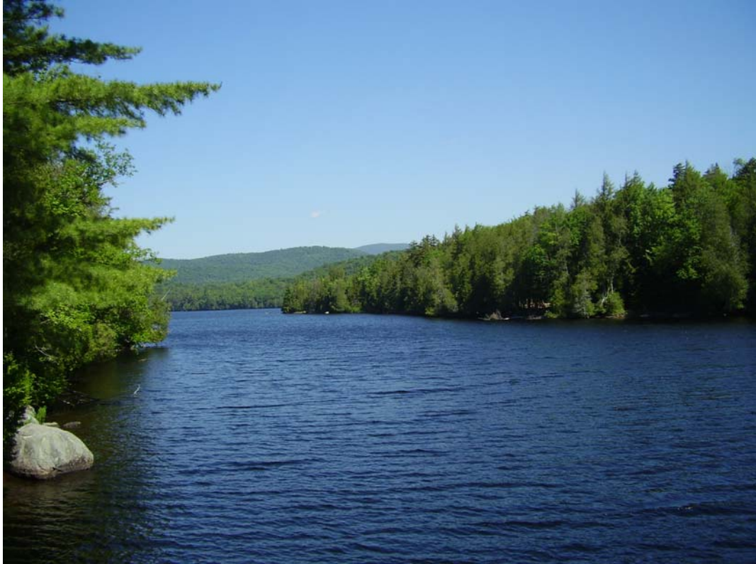
View Of Newcomb Lake From Road Leading Into Main Camp (Figure #19)

In 1953 two brothers named Crandall and Myron Melvin of Syracuse, New York purchased Great Camp Santanoni in an auction, and the accompanying 12,900 acre of land, for a little under $80,000. The Melvins purchased Santanoni at an incredibly good price. Unfortunately, their time at Santanoni was marked with terrible tragedy. The Melvins were wealthy, but they did not have the same type of wealth that the Pruyns enjoyed. Rather than hiring full time staff to tend to the year around upkeep of Santanoni, the Melvins did much of the upkeep themselves (although the Melvins did retain the lone full time staff member, Arthur Tummins, who earlier survived the transfer of ownership from the Pruyns to the Robert C. Pruyn Trust during the early 1930s). The Melvin's time at Santanoni was quite a contrast to the Pruyn's time at Santanoni. While the Pruyn's time at Santanoni was