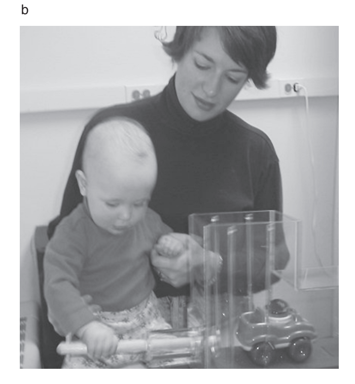
Figure 1: Photographs of infant completing event sequence 'Turn on the light.' (a) Infant places a small car into track of an L-shaped apparatus. (b) Infant pushes a plunger, causing car to travel down the track which trips a small switch and causes a\ light\ to\ illuminate.\ (Reproduced\ with\ permission\ from\ Bauer\ et\ al.\ 2003)