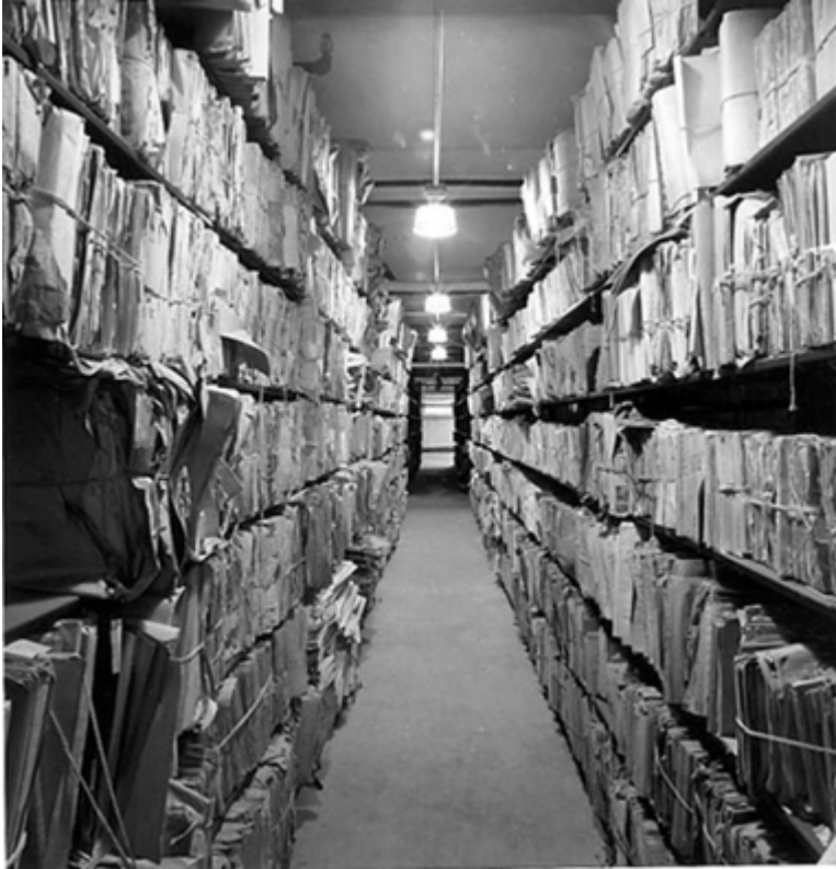
The Prange Collection Stacks: newspapers, magazines, and manuscripts in the basement of McKeldin Library, circa 1960s.

1966, the basement continued without climate control: a shameful decision, given the value of the materials—and staff members—that spent day and night there.