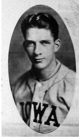
Gordon Prange in his Iowa baseball uniform, from the University of Iowa yearbook, the The Hawkeye. 11

being a historian and teaching in a university. Over the next eight years, Prange obtained three History degrees from Iowa: a BA, an MA, and a PhD. 10