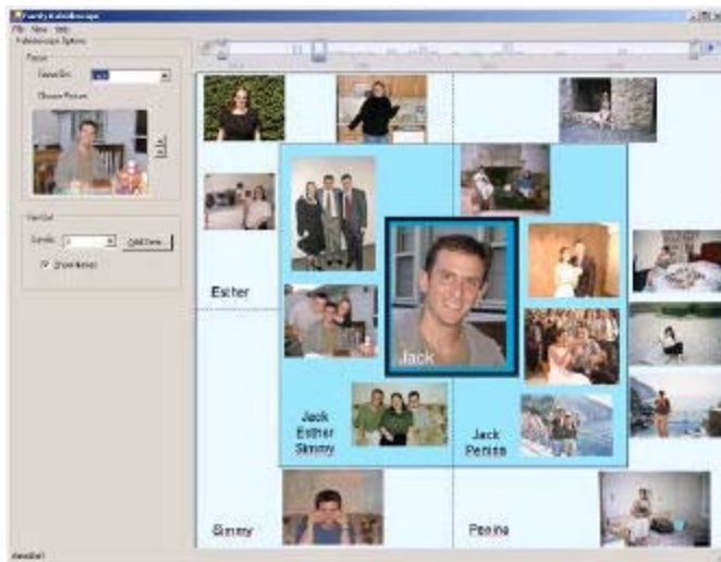
Figure 5. Kaleidoscope

The Family Kaleidoscope is a prototype of an organized view of a set of photographs. It starts with a single individual in the center, and proceeds outward in concentric rectangles, each of which is related in some way to a previous level.