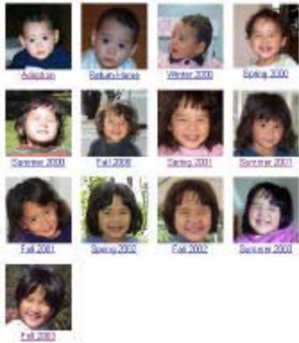
Figure 4. Birthday Collage

Figure 4 is a manually-generated collage: It is a series of pictures of an infant taken at regular intervals, and assembled for sharing with friends and family. Just using the date stamp from the digital camera, such a collage could be automatically generated easily, using a random choice of picture from each month. With some additional “quality of photo” annotations, the best photos could be filtered out and a complete work generated with minimal user effort.