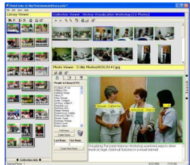
Figure 2. PhotoFinder

PhotoFinder takes photo annotation one level deeper. Users can drag person names or other terms from a scrolling list and drop them onto a photo. Caption text can be placed on or under photos. PhotoFinder also associates annotations with coordinates within each photo [25]. This level of resolution potentially allows queries of “Bill next to John”, for example.