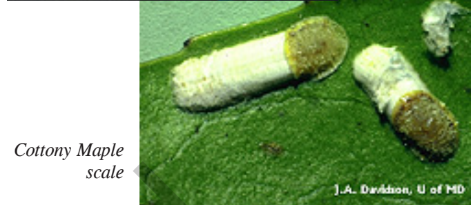
Cottony Maple scale