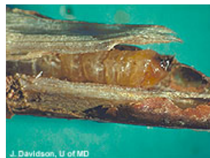
Dogwood twig borer

To control dogwood twig borer, infested twigs should be clipped off several inches below the girdled or infested portion and destroyed. This should be done after wilting occurs and before adult emergence in the spring. This insect usually does not cause serious problems.