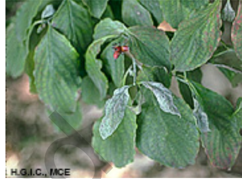
Powdery Mildew on Dogwood

In recent years the Microsphaera powdery mildew has become a more severe and wide spread problem. It appears as a powdery white coating on the leaves from early summer through fall. In some years the powdery appearance is less evident. Under severe conditions, the new leaves can become twisted and distorted. Older infected leaves often develop purple blotches that progress to dead areas. Infections cause the loss of water and photosynthetic leaf area which weakens trees and reduces growth.