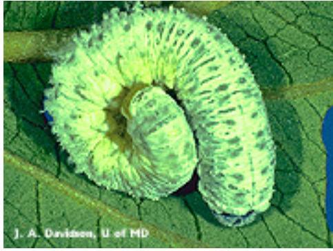
Dogwood sawfly larva

The dogwood sawfly is an occasional pest of dogwood. The larvae feed on the foliage of several species of dogwood. The larvae resemble caterpillars and are most often seen covered with a white powdery material.