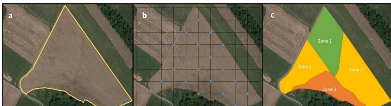
Figure 1. Soil samples may be collected for the (a) whole field, (b) on a consistently spaced grid or (c) by management zones

To manage a field by the grid method, a layer of equally spaced, intersecting lines is laid over a map or photograph of the field (Figure 1b). Compared to the whole-field method (Figure 1a), many more samples will be taken. The easiest way to create a grid is through GIS software, which can be expensive, although there may be free or cheaper