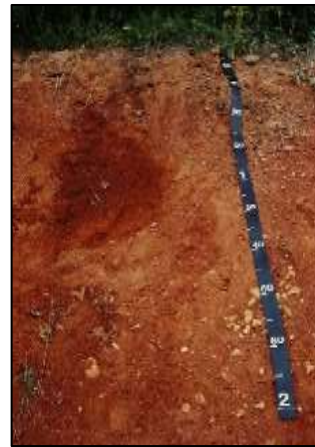
Figure 4. The red color of this soil indicates oxide coatings and greater weathering. Soils like this will have more Al, but can also show greater tolerance to higher pH and micronutrient availability.

Therefore, sandy soils low in Al could possibly tolerate pH lower than 5.5. In addition, soils very high in organic matter can remove Al from the soil solution, and can also tolerate lower soil pH for crop growth. In Maryland, weathered soils with high clay content are the most likely to experience Al toxicity when the pH is below 5.5.