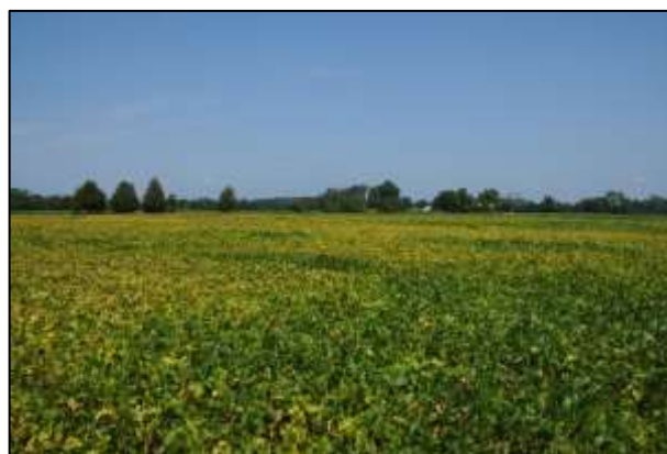
Figure 3. A soybean field with a manganese deficiency due to higher pH

If a micronutrient deficiency is observed in an acidic soil, it is probably related to lower concentrations and the leached nature of the soil.