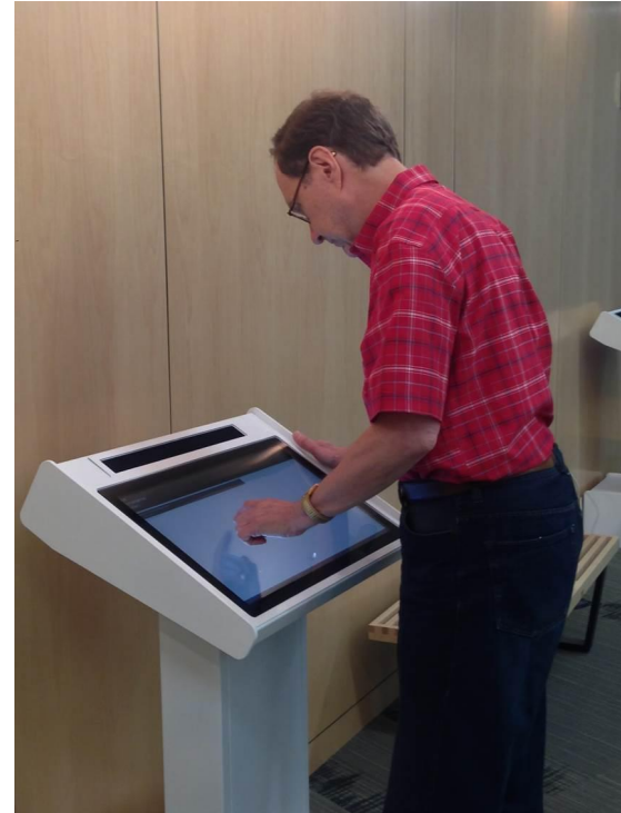
Exhibit and Menu Design ---> Implementation ---> User Testing ---> Refinement