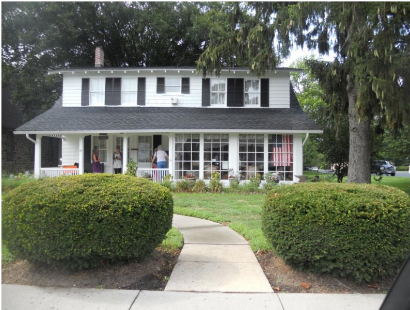
The Read House, c.1730