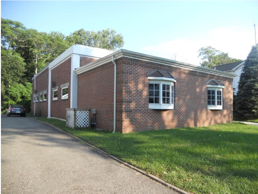
One Big Room