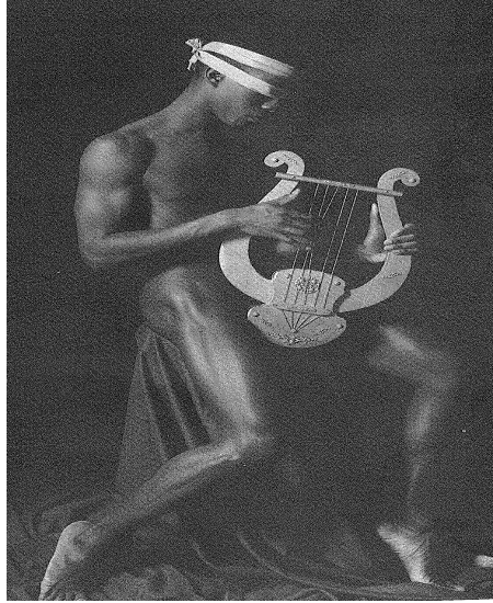
Figure 3. New Hope (1993), Rodney Hurley.