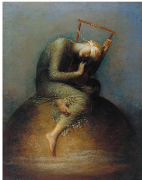
Figure 4. Hope (1886), George Frederic Watts

Hurley's photograph, "New Hope" reimagines the figure of Hope as a black man living in the 'Age of AIDS.' His lyre has a full set of strings, unlike Watts's image. His body is positioned upright, and his muscles flexed to evoke movement rather than stasis. This image has inspired my thinking about what it might mean to begin our theorizing of black, queer, and queer of color politics through this black gay cultural movement. For