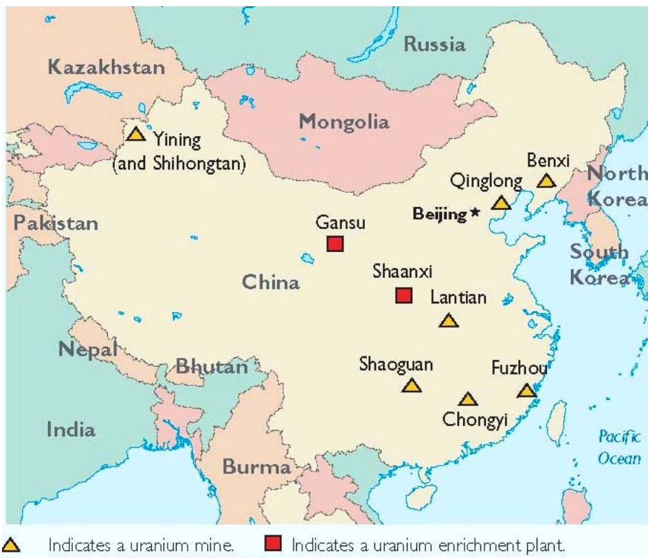
Figure 1. China's uranium mines and enrichment facilities

in 2010 (TENEX, 2007). Figure 1 shows China's major uranium reserve areas and enrichment facilities (OECD and IAEA, 2009).