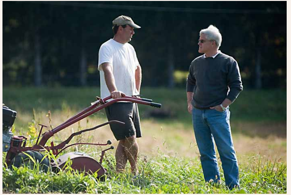
USDA loan programs target a portion of their loan funds to beginning producers. To qualify as a beginning farmer for either a direct farm operating loan or a direct farm ownership loan, a farmer needs to have operated a farm for less than 10 years, meet the program eligibility requirements (see Figure 1), and substantially participate in the farming operation. For a farm ownership loan, the beginning farmer cannot already own a farm larger than 30 percent of the median-size farm in that county.

who may not meet a lender's normal underwriting standards.