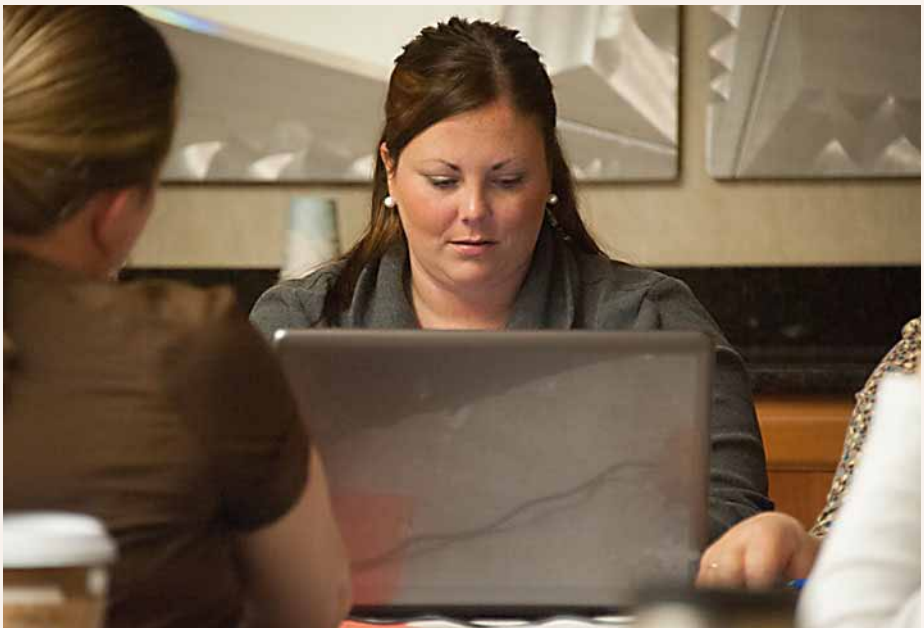
Before applying for a loan with any agricultural lender, a beginning producer would want to develop a business plan for the new agricultural operation. In the business plan, lenders would like to see that you, the potential borrower, understand how your crops will be marketed and that you have backup plans for the possibility that the market for those crops disappears, contingency plans for when equipment breaks, and risk mitigation tools such as crop insurance and/or marketing agreements where feasible.

The third potential source of capital for beginning farmers is the Farm Credit System. Created in 1916 by Congress, this system provides a network of independent, member-owned lenders across the