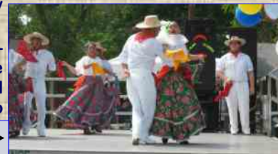
Dancers at Langley Park Day →