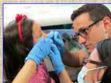
Dentists at Health Check

"We have reached, as Dylan says, the 'bottom of a world full of lies' underneath war, especially when it comes to such an absurd war as the one against drugs. We call such bottom death, humiliation, illegal trade of guns, money laundering, criminalization, corruption, fear, horror, prisons, the strengthening of crime and government violence. For the same reason, we refer to it as the crisis of democracy, the annihilation of freedoms and the contempt for immigrants. This bottom of pain is also, as the song of Dylan says, 'a burden that seems more than we can bear.'" ( http://www.caravanforpeace.org/caravan/ ) Let's all read about the Prohibition against alcohol that was the law from 1920 to 1933 and led to corruption, murder, and more. And we're repeating that!!!