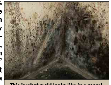
This is what mold looks like in a room!

Most of the apartments in University Gardens and Villas at Langley visited by the BLP staff over the years are in good condition; the apartment managers appear to do a good job, and the tenants do too. But that's not the whole story of living in apartments in Langley Park. There are apartments with bugs, leaks, peeling paint, mold, broken locks, and more. Tenants' complaints are often not acted upon, at least in a timely fashion. To make matters worse, some of the ill-maintained units have a high rent; perhaps the paying tenants are worried about their immigration status and therefore overpay without complaint. Two complexes often mentioned for their poor conditions are Bedford Station and Victoria Station.