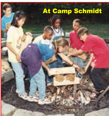
At Camp Schmidt