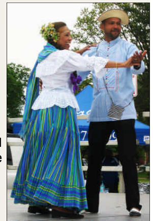
The Panamanian dance group, Grufolpawa Panamanian, performed beautiful older traditional dances as well as more contemporary ones.