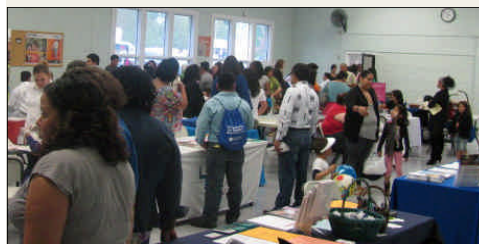
The health professionals were kept busy as they screened, counseled, and more.