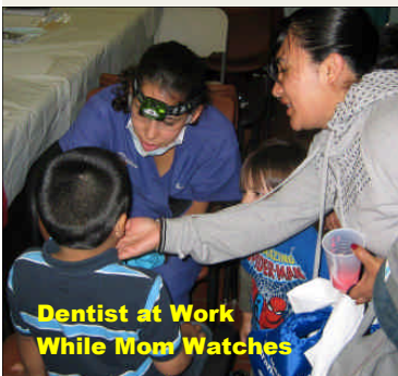
Dentist at Work While Mom Watches

What a wonderful day! The songs and dances were excellent, the health fair screened and counseled hundreds of people, the children were occupied with a variety of game and art activities, a great clown paroled the area on stilts and a unicycle, and many agencies and associations provided information.