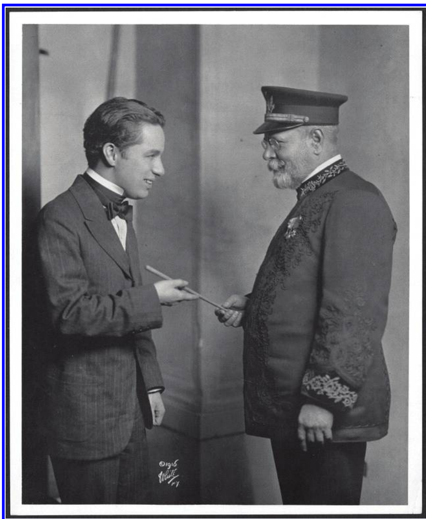
Figure 1 Sousa with another great actor and musician, Charlie Chaplin, in 1916.