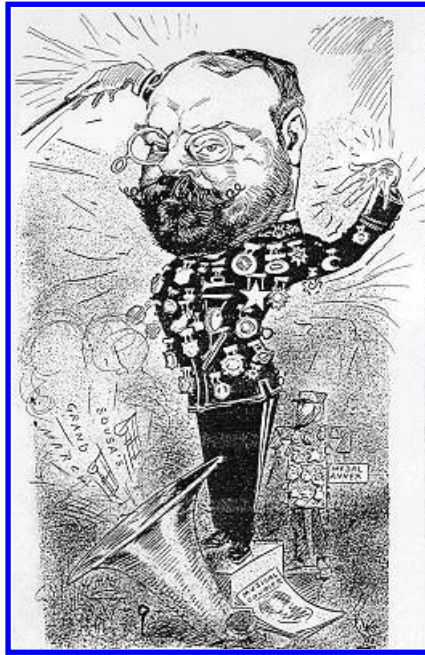
Figure 5 Sousa in a particularly commanding pose. Musical Courier 52 (25 April 1906): 18.

While reinforcing a new sense of physical masculinity, Sousa also provided a bridge into the modern world, where business and organizational skills could serve as replacements for bodily manhood. Sousa thus became much more than a composer or conductor; he was an entrepreneurial organizer of men (see Fig. 5):