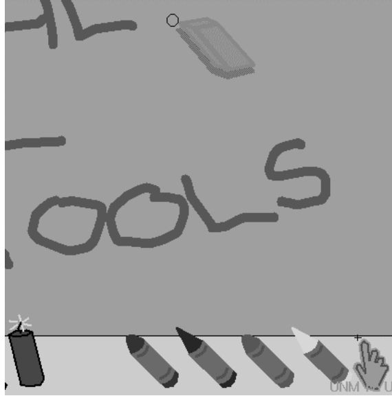
Figure 2: Some tools used in KidPad: An eraser, a bomb (for erasing an entire drawing), some crayons, and a hand (for moving objects).