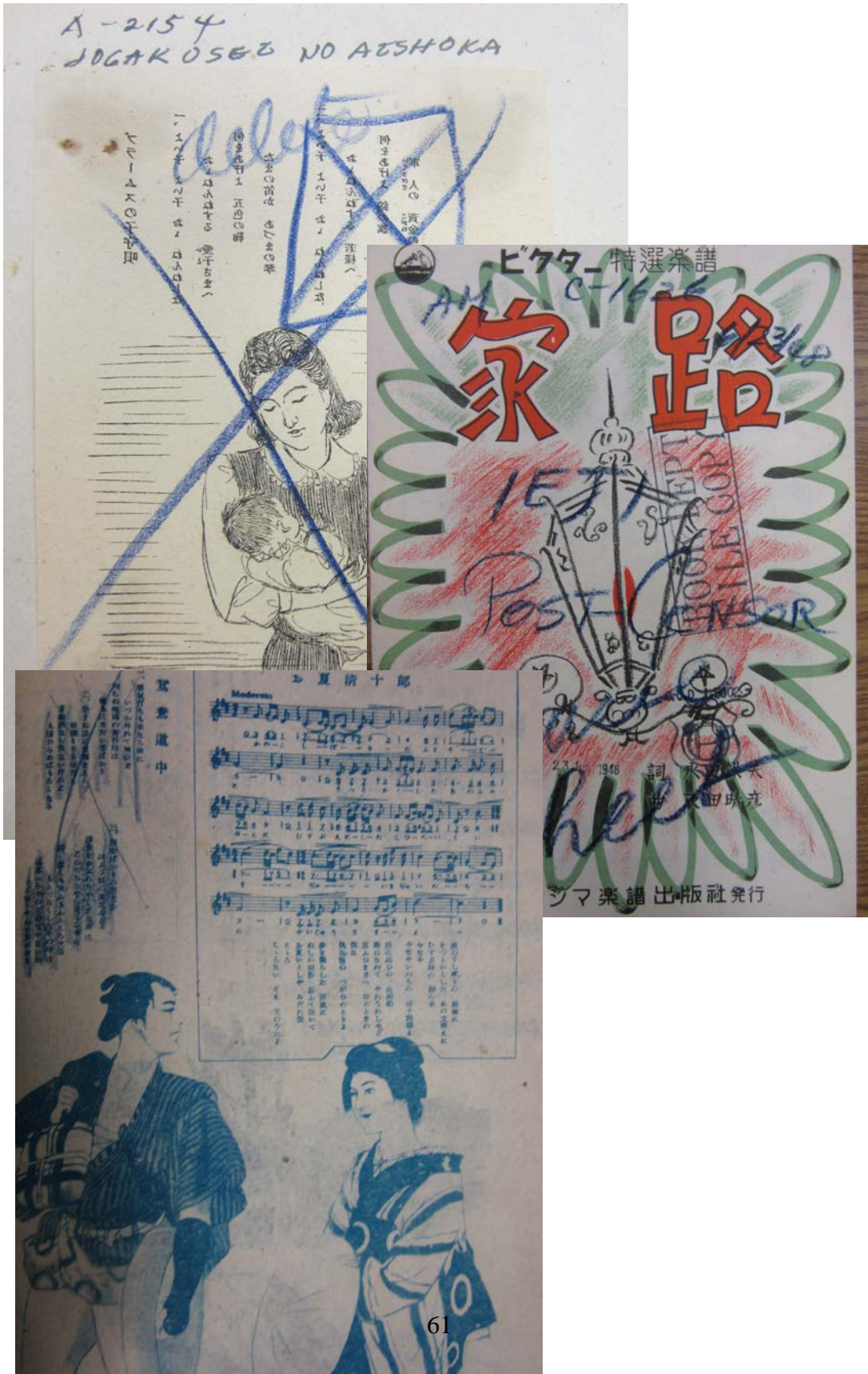
Plate 7: Examples of censors' markings.