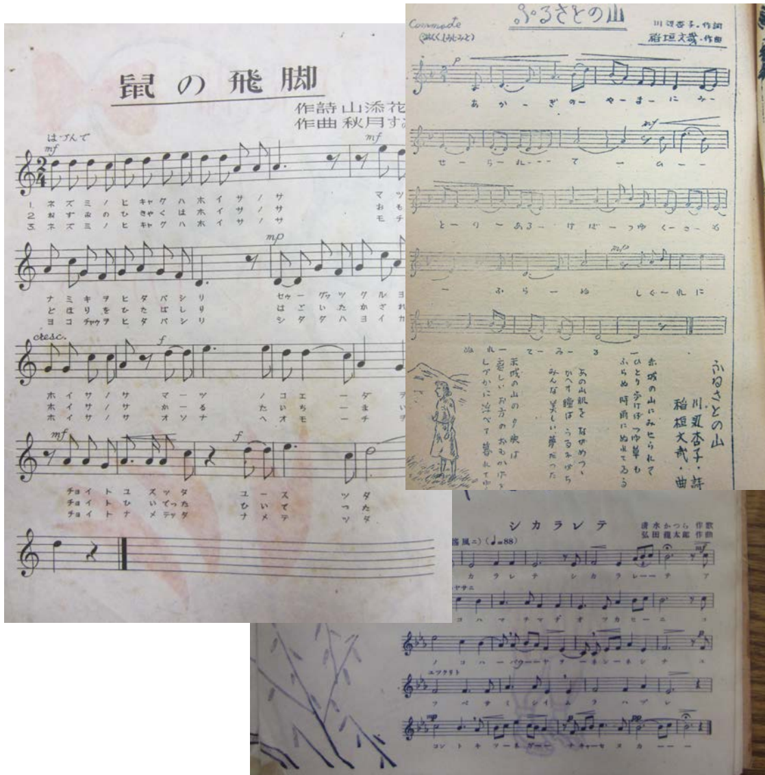
Plate 3: Japanese Chev -style notation.