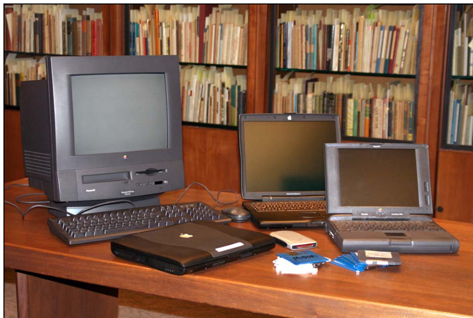
Figure 4. The Rushdie computers at Emory