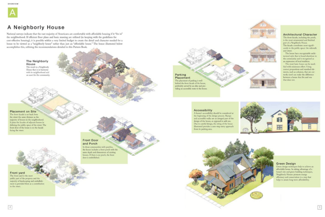
Design Model, A Pattern Book for Neighborly Houses, Congress for New Urbanism.