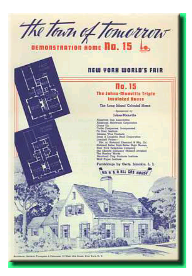
Pamphlet, House #15, Community Interests Zone, "The Town of Tomorrow," 1939 New York World's Fair.