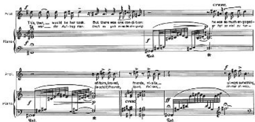
Figure 3.3. The Prologue’s recitative marked by solo piano accompaniment, exclusive to this single example of many recitatives in the opera. (Image: Britten, The Turn of the Screw , 4)

The “Prologue” is set as simple recitative with sparse piano accompaniment and a relatively independent tenor voice, whose speechlike quality may indicate a closer association to delivering factual information than the material in the Governess’ account (see Figure 3.3).