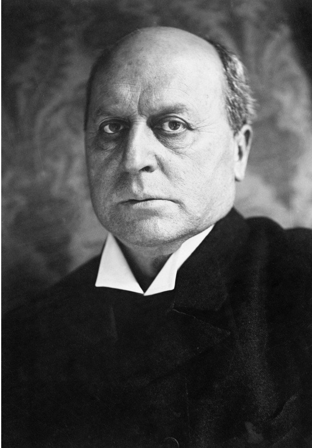
Figure 1.1. Henry James in 1910.