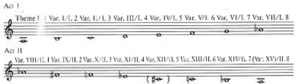
Figure 3.9. The shifting tonality from scene to scene creates an ascending and descending model, suggesting a distancing from and return to reality. (Image: Howard, 93)

The two bookend scenes of the opera use A as the tonic substitute, while the two inner scenes (Act I finale and Act II opening) use Ab as a tonic substitute. The tonal centers of the remaining scenes ascend and descend, forming a rising/falling tonal arch (see Figure 3.9).