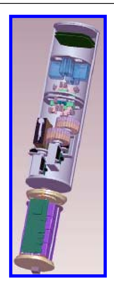
Figure 2. Schematic of a prototype Autonomous Microbial Genosensor (AMG), a NASBA-based amplification and detection platform.

Figure 1. Schematic of the Environmental Sample Processor (ESP) developed by Chris Scholin at MBARI, an example of the first generation of genetic sensors to be used in the oceans.