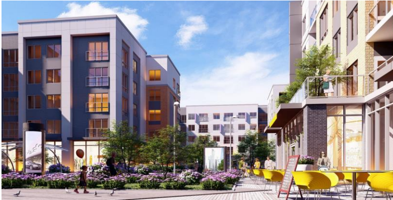
Rendering of fully developed site area