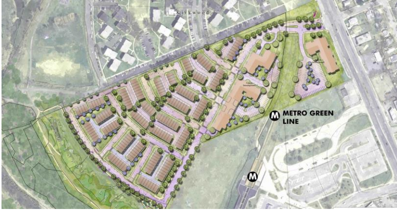
Bird's eye view of Gilbane development (perimeter of site area)