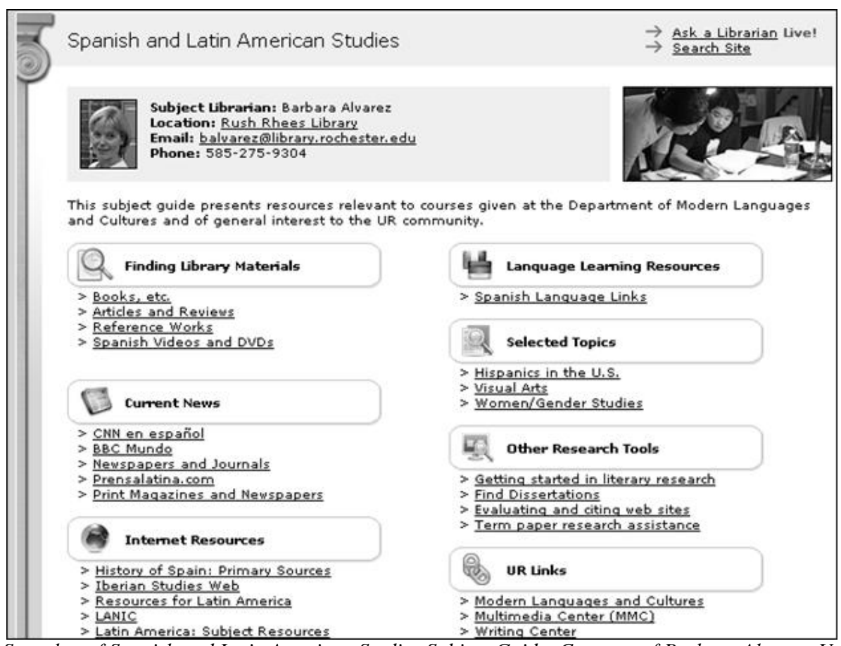
Figure 3. Snapshot of Spanish and Latin American Studies Subject Guide.

This guide is not only eye-catching, it is user-friendly. Even a subtle use of small graphics is welcoming, as in the University of Rochester's Spanish and Latin American Studies guide shown on Figure 3.