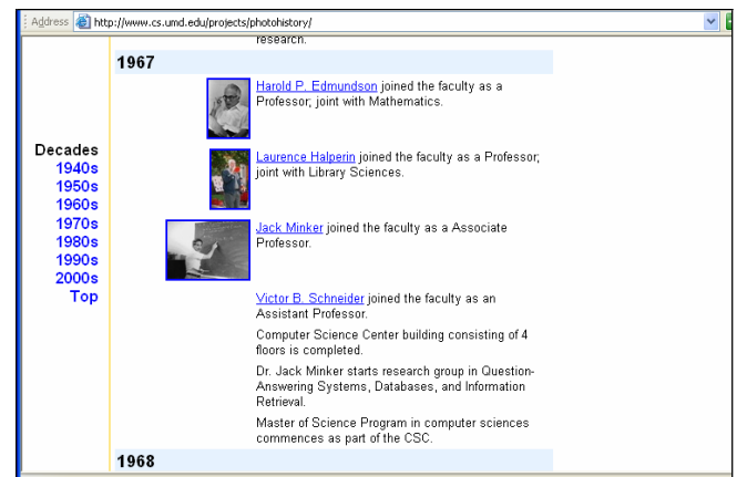
Figure 1: This depicts the initial design of the CS PhotoHistory photo libraries as a timeline of events and photographs of the Department of Computer Science at the University of Maryland. The hyperlinked faculty names lead to a page detailing information about that faculty member including field committee, dates, awards, and other biographical information.

These two domains served as the driving model towards a timeline of photographs (Figure 1) and events, along with a complete index of all faculty members since the department’s inception. Each member listed in the faculty index has his or her own page devoted to displaying all photographs and biographical information.