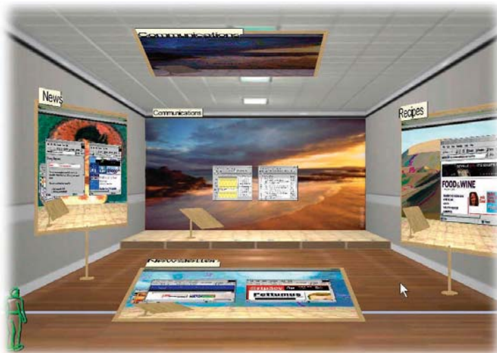
3 Task Gallery from Microsoft enables users to perform Windows operations, although it restricts movement to in/out. Applications are on the sides, floor, and ceiling.