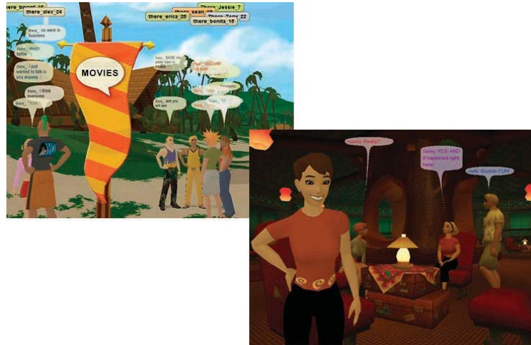
2 There.com provides avatars and text balloons to show chat discussion.

Web standards like VRML, which didn't generate huge commercial successes, have given way to richer ones such as X3D. This standard has major corporate supporters who believe it will lead to viable commercial applications.