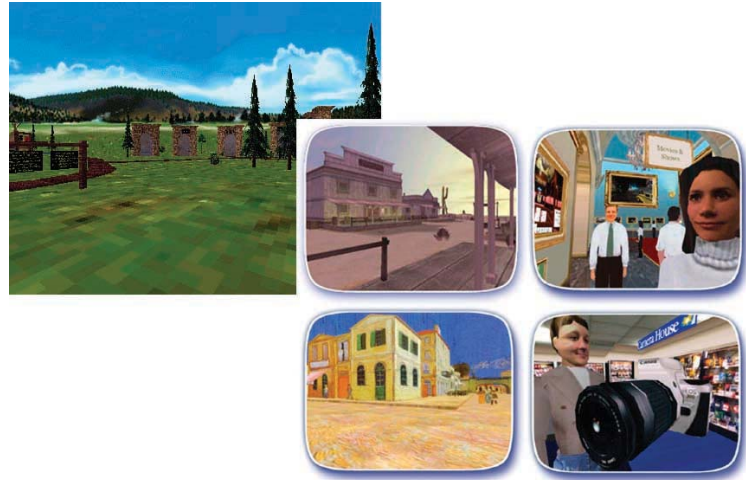
1 ActiveWorlds allows construction of 3D worlds and movement of avatars within the worlds.

Three-dimensional art and entertainment experiences, often delivered by Web applications, provide another opportunity for innovative applications. Early