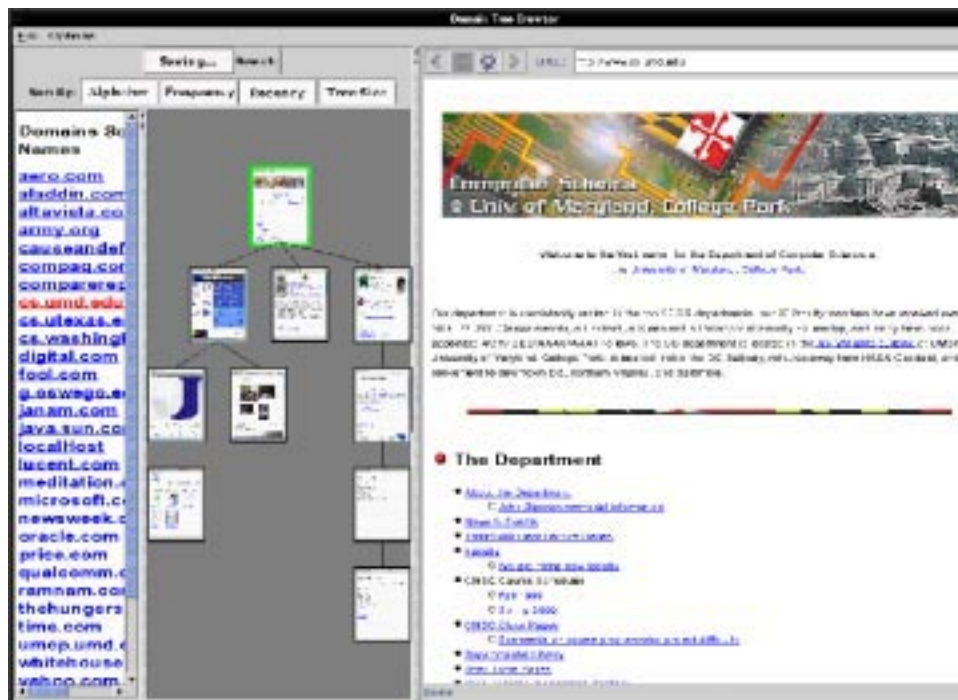
Figure 1: A Screen Shot of Domain Tree Browser

DTB automatically maintains web histories, with minimal effort from the user. The tool organizes the visited URLs based on web-site domains. It's zoomable user interface automatically resizes thumbnails to fit the window.