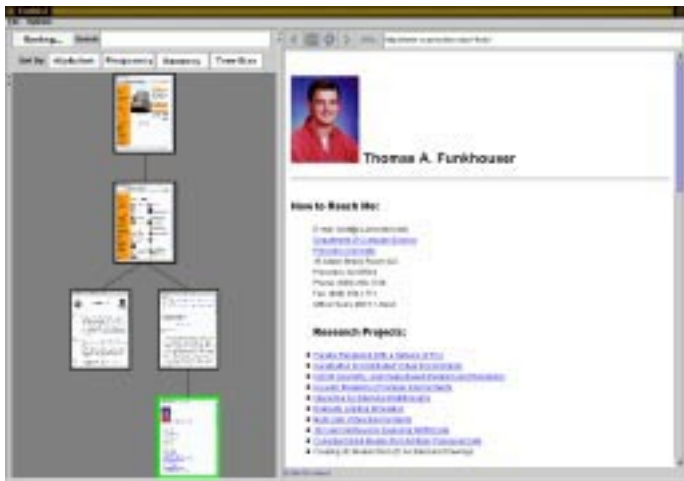
Figure 2: Elastic windows: The domain names are hidden.

The domain panel displays a list of all the domains visited thus far by the user. Each domain name is a clickable link. It has a corresponding tree which can be displayed on the tree panel by clicking on the domain name in the domain panel. When a user clicks on a link in the browser window or enters a new URL and the domain corresponding to this URL does not exist, a new domain is added to the domain list and is made current. The current domain is color coded red which distinguishes it from the other domains in the domain list that are in blue.