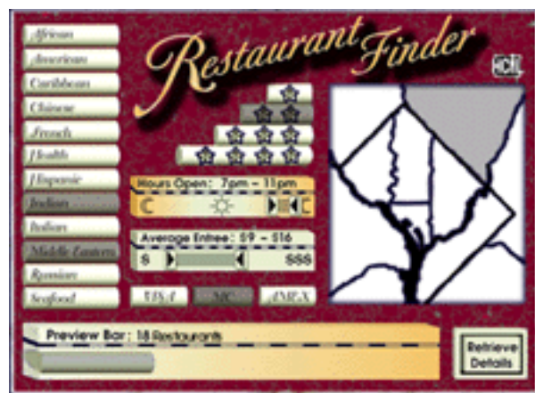
Figure 3: The Restaurant Finder

Detailed Designs - Assistance: No matter how well-designed a website is, there will always be a need for online and human assistance. The designers goal should be to reduce the need for assistance, but with ever greater numbers of users with ever greater expectations, descriptions of system features and contents, files with frequently asked questions (FAQs), email help desks, and access to phone service (possibly for a fee) should be made available.