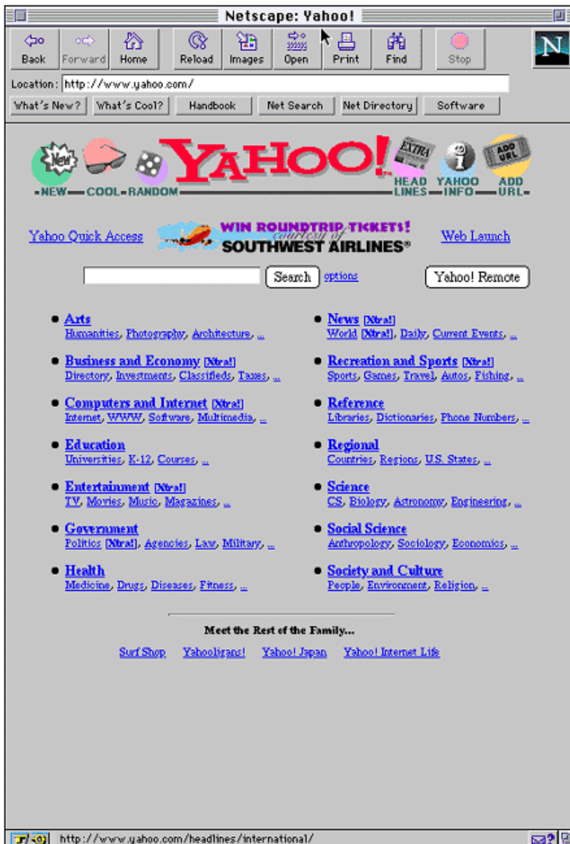
Figure 1: Yahoo index page (http://www.yahoo.com/)