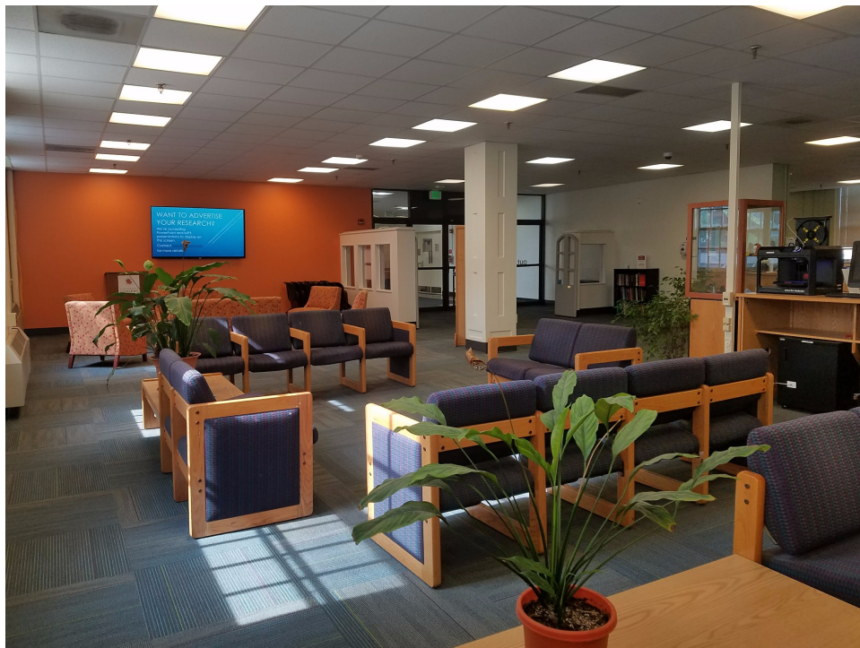
Figure 3: EPSL's completed renovation, including new seating and new technology