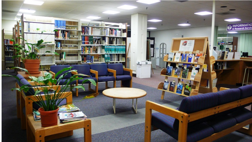
Figure 2: EPSL reference area before being renovated

regular circulating collection. Additional seating has also been added for students to collaborate, study, and, even occasionally, sleep. New technology has also been added to the space, including a TV monitor, which is used for EPSL's STEAM Salon talks and display student projects, and 3D printers, which is another popular service at EPSL. Renovations are planned at other locations to develop more collaborative and learning spaces for users.