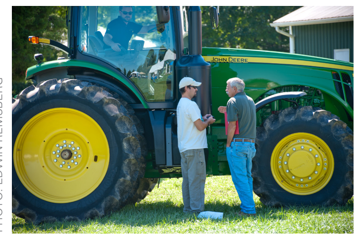
Privately held agricultural data can be excludable while solely in the possession of the party that generated it; however, once the data are shared with other parties or aggregated, excludability is eliminated, at least from the farmer's perspective.

The next logical question is whether data can be considered excludable or non-excludable (Griffin et al., 2016). Excludability depends on several factors such as whether the data was shared with a third-party or within a community, and if ownership can be maintained. Excludable goods carry the owner's right to deny access to others. Most privately held goods are excludable.