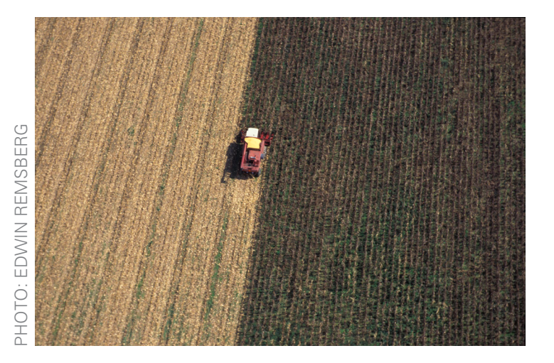
Combining each farmer's data across a geographic region is generally considered "big data."

The concept of big data in agriculture refers to aggregated farm data gathered from numerous farming operations into a single database or repository. For example, corn growers may collect site-specific geospatial and metadata (information which describes, explains, or locates data to make it easier to retrieve, use, or manage) across many acres. Site-specific geospatial data may include as-applied seeding rates, soil nutrient information, and yield monitoring data. Metadata include the number of acres, and when, where, and which inputs were applied and cultivars planted.